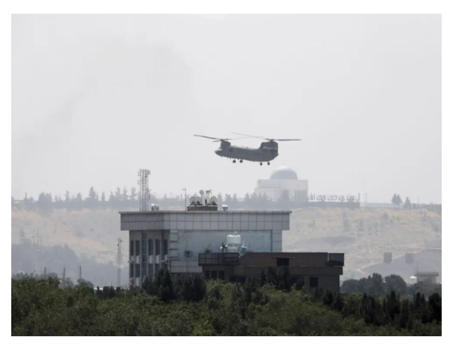
Americans being evacuated from the roof of the US Embassy in Kabul on August 15

On August 6, the first Provincial capital, Zaranj, fell to the Taliban and led to a violent onslaught of offensives throughout other Provinces. By August 15, the United States Embassy in Kabul was evacuated and Taliban fighters soon stood outside chanting "Death to America." From there, the stories of devastation only got worse. Americans and our Afghan partners struggled desperately to get to the airport for evacuation - many of which never made it - billions of dollars of US military equipment fell into the hands of the Taliban to now be used against our troops in the region, violence erupted in the streets, women and girls had their freedoms stripped from them, and of course, worst of all, 13 brave US service members lost their lives following two cowardly suicide bombings outside of Hamid Karzai Airport. Each of these tragedies was preventable. Bad decision after bad decision from this Administration compounded in an utter failure that has resulted in the loss of Afghanistan for generations. Those responsible must be held accountable for this disaster.