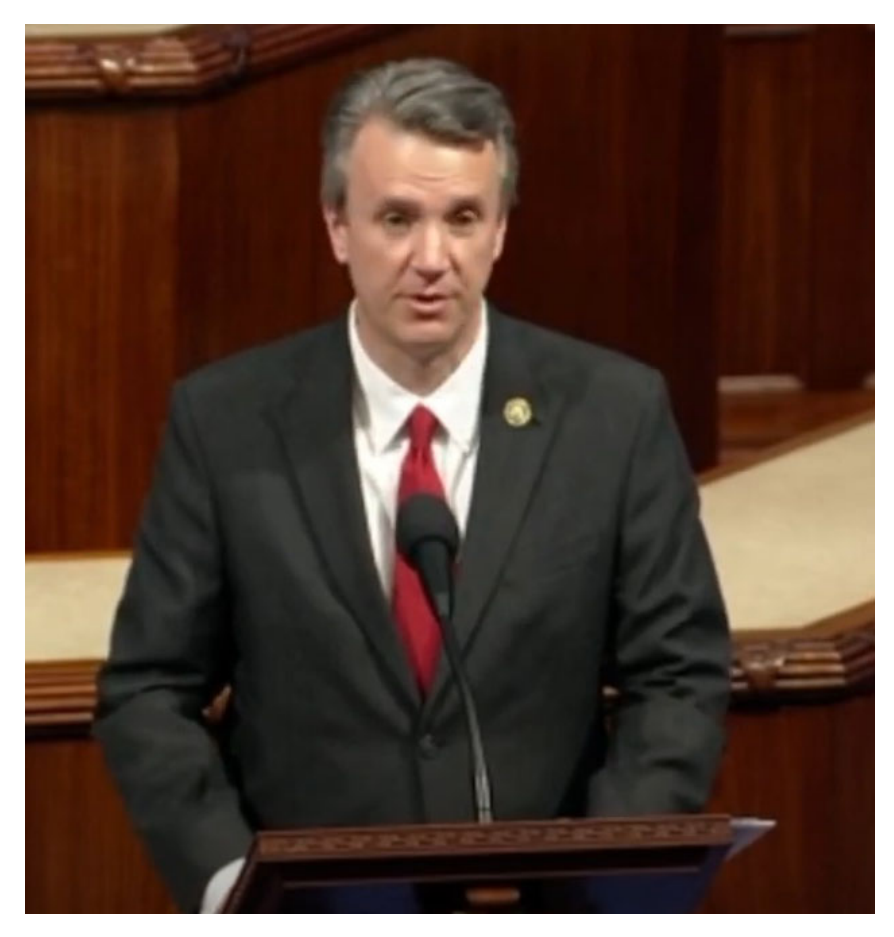
Watch my floor speech recognizing the Harrisonburg High School Electric Vehicle Racing Team <u>here</u> or above.

teams representing the United States in the international EV competition in Abu Dhabi. I was pleased to recognize the racing team and wish them success at the Grand Prix.