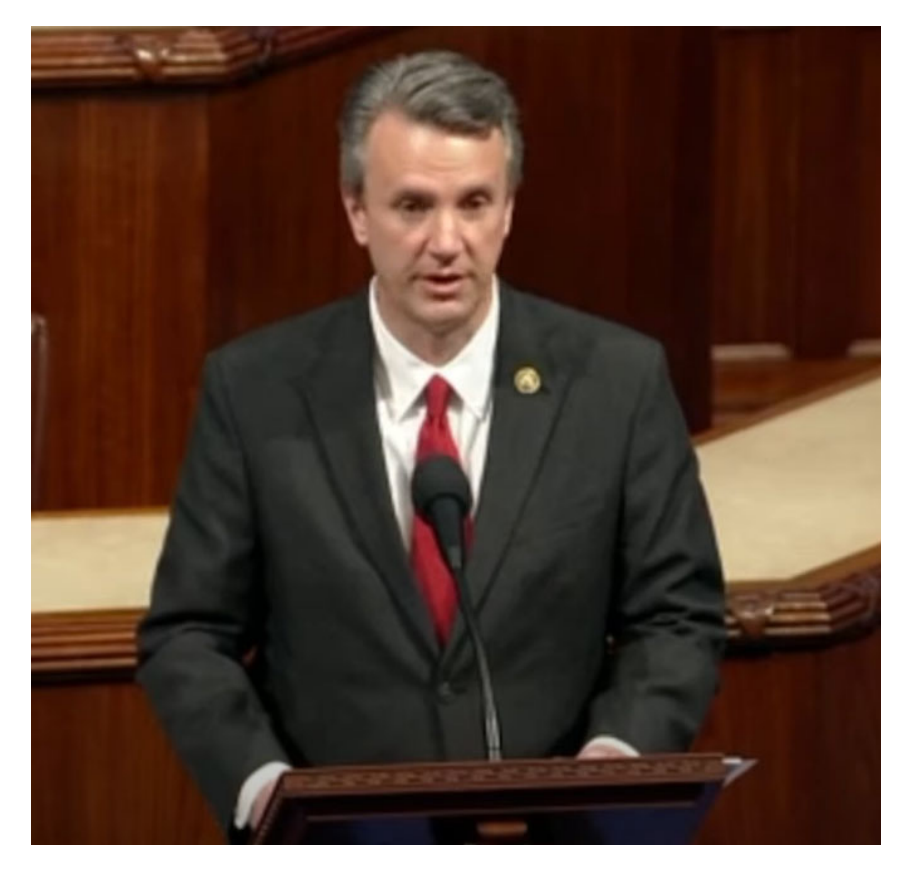
Watch my floor speech speaking on the impeachment of Secretary Mayorkas <u>here</u> or above.

CBP seized an all-time record of over <u>27,000 pounds</u> of fentanyl at the Southwest border. These seizures are far more than enough to kill every American in the country.