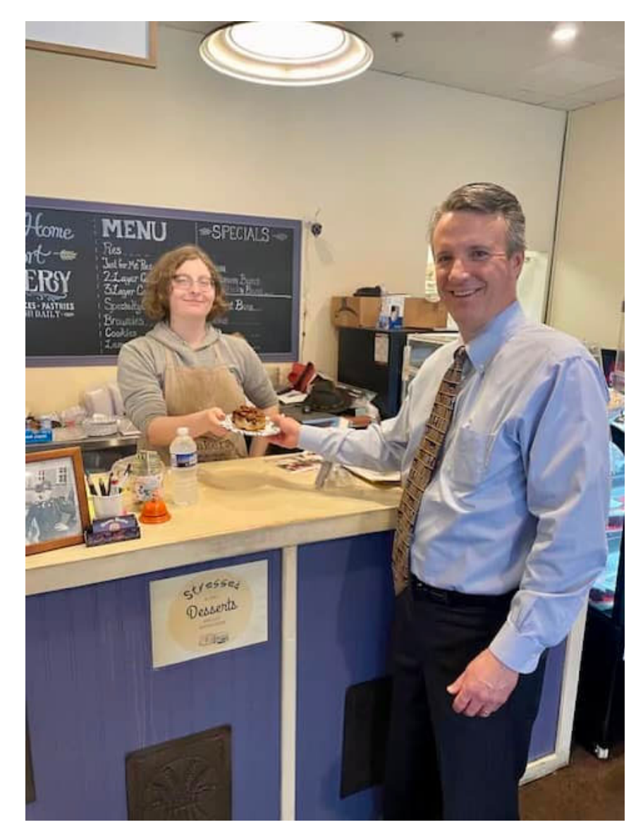
I had a great time stopping by Down Home Comfort Bakery in Front Royal, VA, for a delicious cinnamon bun! If you're in the area, swing by and satisfy your sweet tooth!

Thank you for the opportunity to serve as your Congressman. If my office can ever be of assistance, please contact my Washington office at (202) 225-5431.