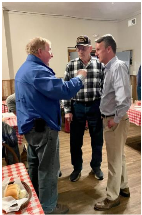
Next, I had a great discussion and shared some coffee with folks at my Roanoke County town hall. Thank you to all who made it out.