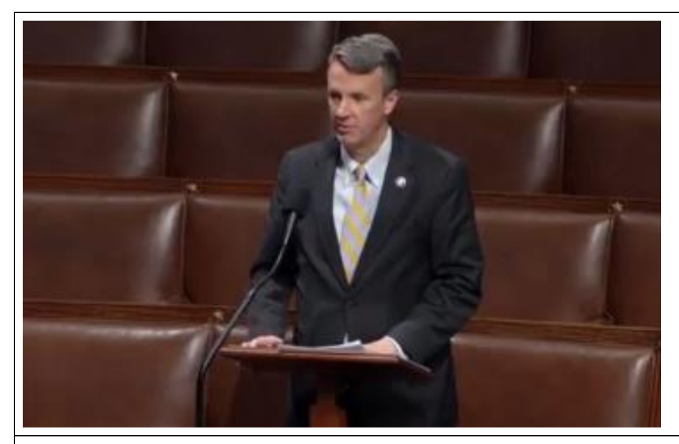
I took to the House floor to stand up for western Virginians who demanded change in Washington to rail against this deal to hamstring the American people. Click <u>here</u> to watch my speech.