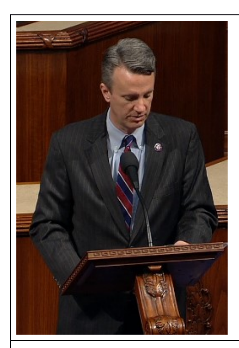
Click <u>here</u> to watch my speech honoring the Fincastle Volunteers Firefighters for their 75th Anniversary

I was pleased to recognize our Fincastle Volunteer Fire Department for the celebration of its 75th Anniversary. I thanked the officers leading the department and the 30 volunteers at the helm for their critical assistance to Botetourt County Fire and EMS services, offering localized emergency fire prevention and mitigation support for the people of Fincastle.