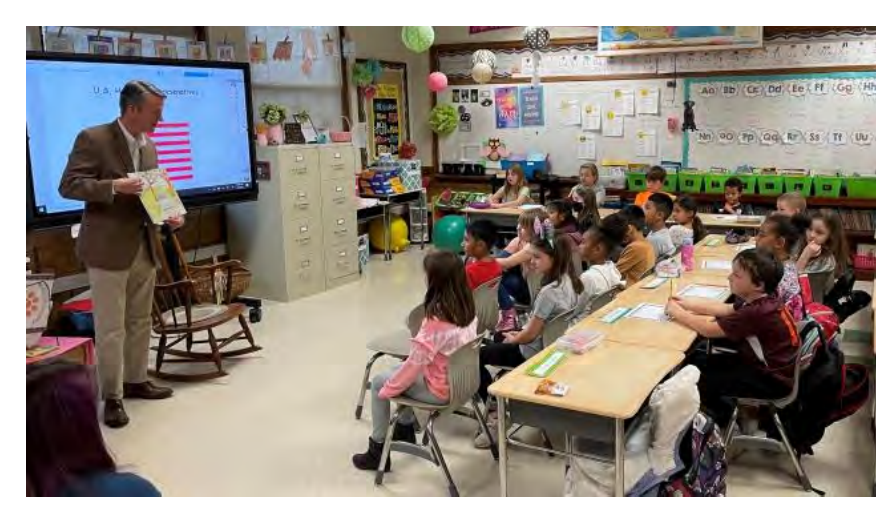
Reading to students at Mount Pleasant Elementary School in Roanoke.

"Coffee With Your Congressman" Town Hall Events