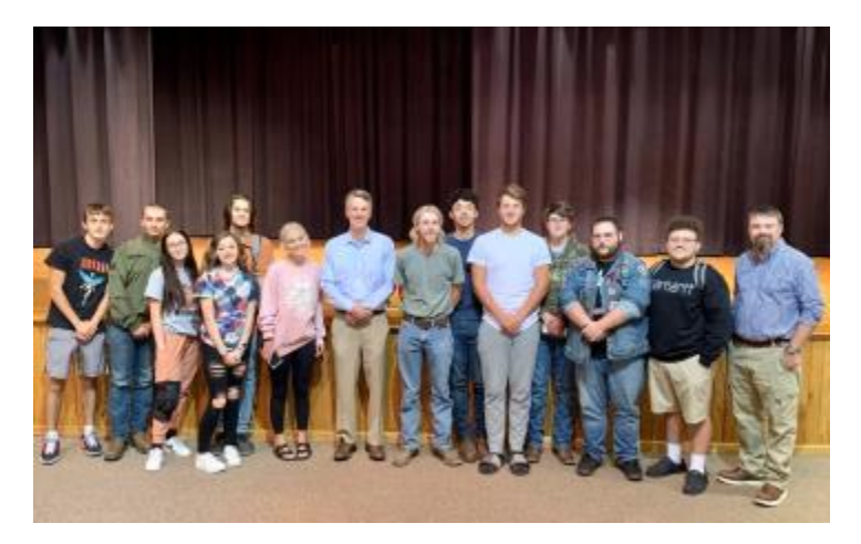
Young people are the future leaders of Virginia and our Nation. I was proud to speak with students from Bath County High School on the importance of civic engagement and service.

Thank you for the opportunity to serve as your Congressman. If my office can ever be of assistance, please contact my Washington office at (202) 225-5431.