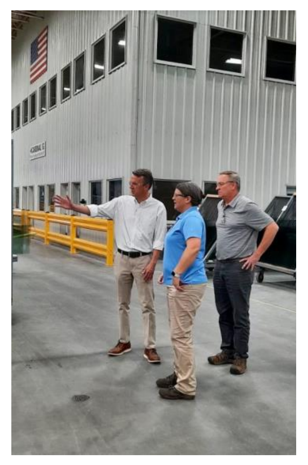
Cardinal Glass Industries 'engineers the future of glass,' and it was great to tour their facility in Vinton and hear about their products and technologies.