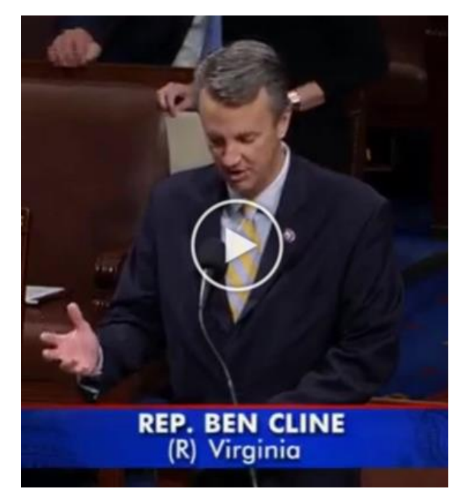
Defending the Second Amendment during House Floor debate