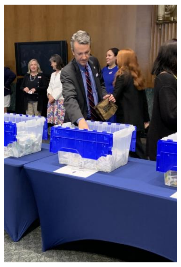
Assembling United Service Organization (USO) care packages for deployed troops