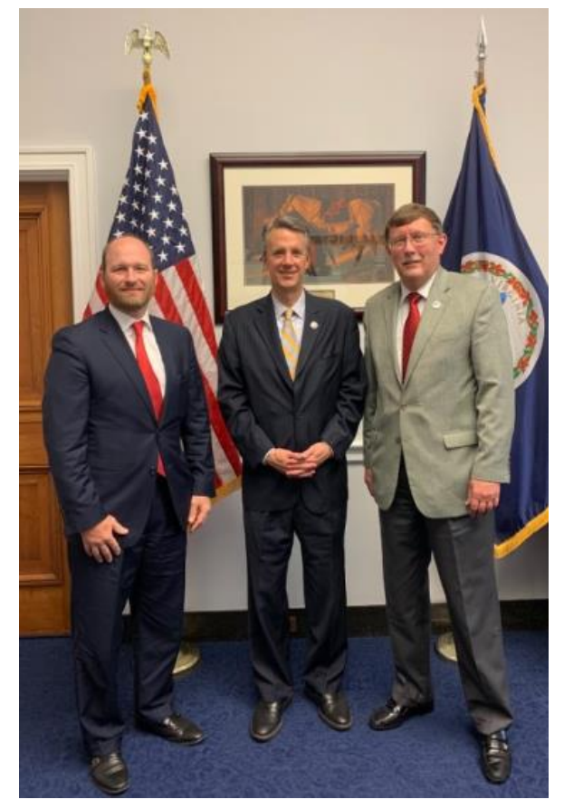
Meeting with the American Association of Christian Schools