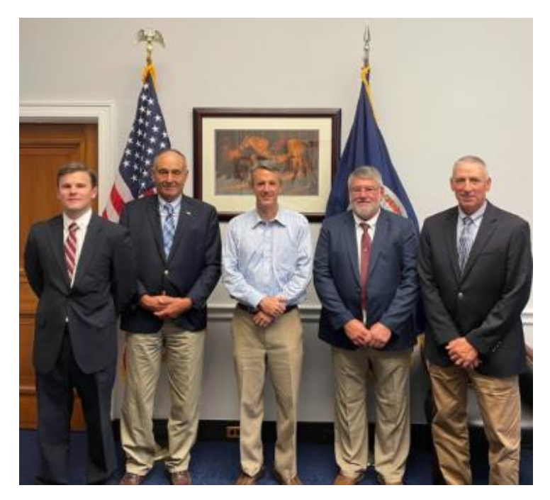
Meeting with members of the Virginia Farm Bureau