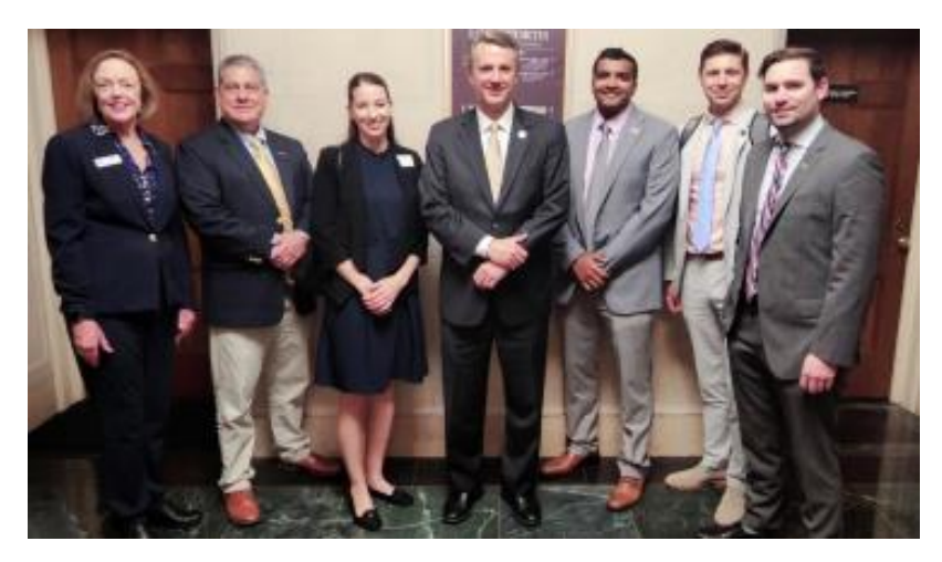
Meeting with a number of Veterans Service Organizations to discuss the PACT Act, including the Military Officers Association of America, the American Legion, the Tragedy Assistance Program For Survivors, Veterans of Foreign Wars, and Iraq and Afghanistan Veterans of America

Supporting our troops with the needs to fight our Nation's battles when called upon and fighting for those who fought for us continues to be one of my top priorities as your Representative.