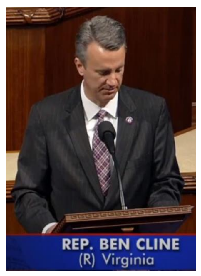
Discussing inflation and the need to stop massive deficit spending on the House Floor

wake-up call to return to fiscal sanity for Democrats in Congress and President Biden. Unfortunately, no one needs a crystal ball to predict that my colleagues on the other side of the aisle will hit the snooze button on this wake-up call. However, I will continue to fight to rein in spending to drive down inflation, unleash the American economy, and protect the wallets of the American people.