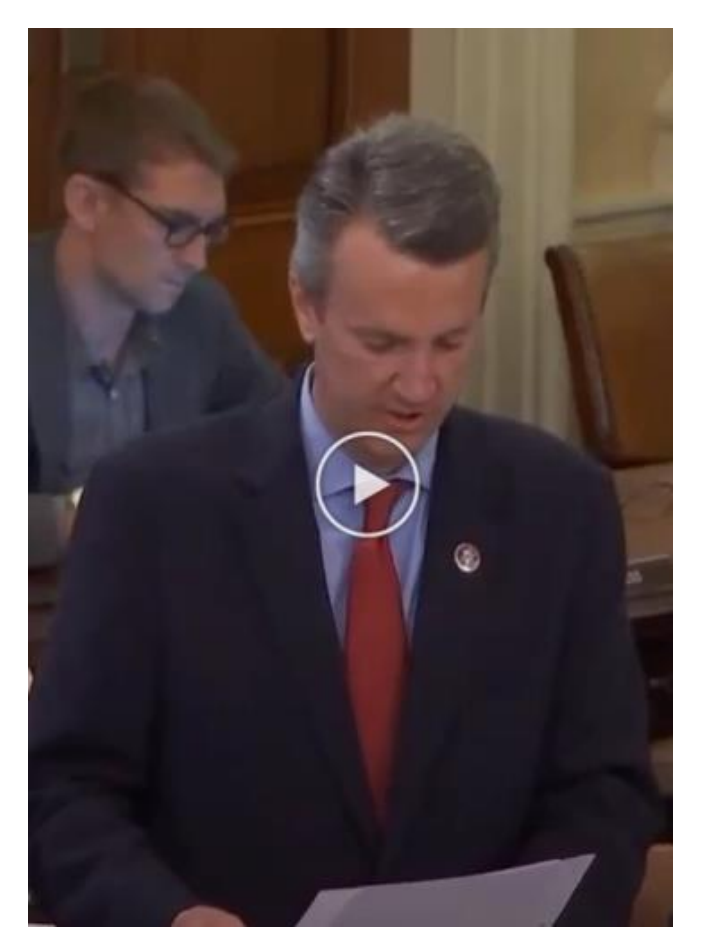
Introducing my amendment to bolster border security

Border Protection. Unfortunately, but not unexpectedly, my amendment was rejected by Committee Democrats.