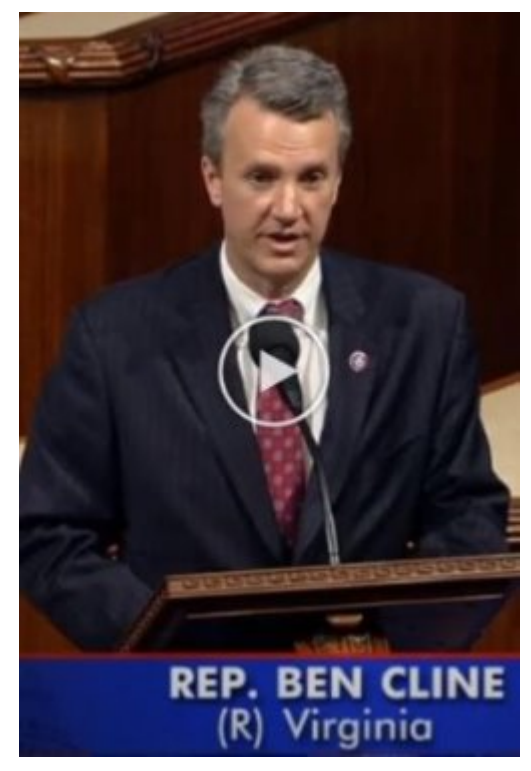
Speaking on the state of the American economy on the House Floor