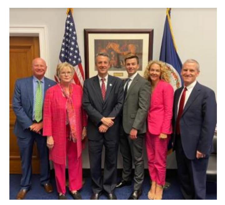
Meeting with a representative of McKee Foods and members of Family Enterprise USA