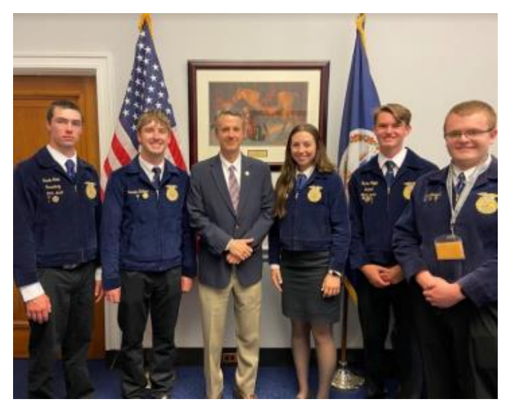
Meeting with students of the Future Farmers of America (FFA)