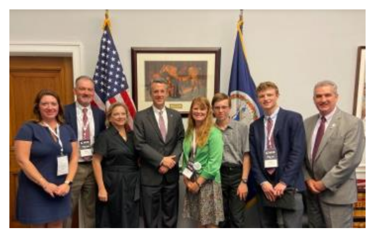
Meeting with members of the National Federation of Independent Businesses (NFIB)