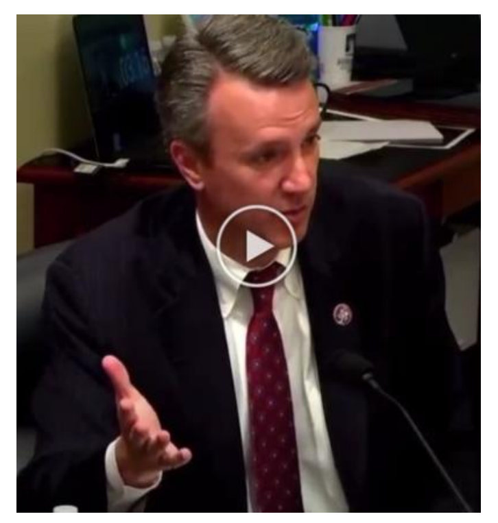
Speaking against the ARP in a recent Budget Committee hearing