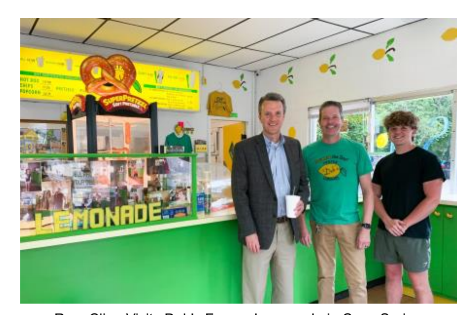
Rep. Cline Visits Deb's Frozen Lemonade in Cave Spring

As we celebrated National Small Business Week, I took time to visit small businesses in our area, such as Deb's Frozen Lemonade in Cave Spring, to hear from owners like Keith Liles about how they're handling the current economic downturn. Small businesses are vital to the economic success of our Nation, employing more than 61 million Americans or nearly 47% of the workforce. Further, small businesses create two-thirds of new jobs and deliver 43.5% of the United States' GDP. As mom-and-pop shops continue to recover from COVID lockdowns and struggle to cope with inflation, I wanted to ensure I can take their concerns up to Washington. In Congress, I will continue fighting for pro-business policies that help spur economic growth.