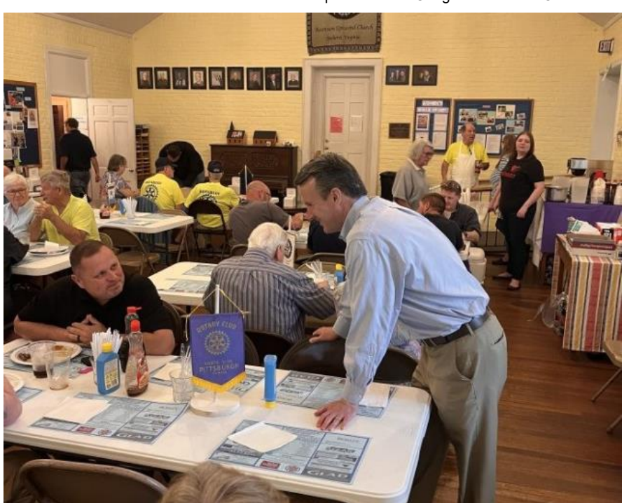
Amherst Rotary Pancake Day - Amherst, VA