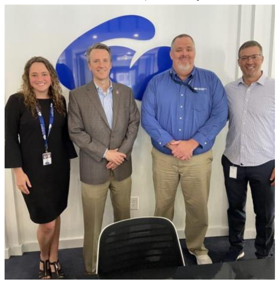
CloudFit Software - Lynchburg, VA