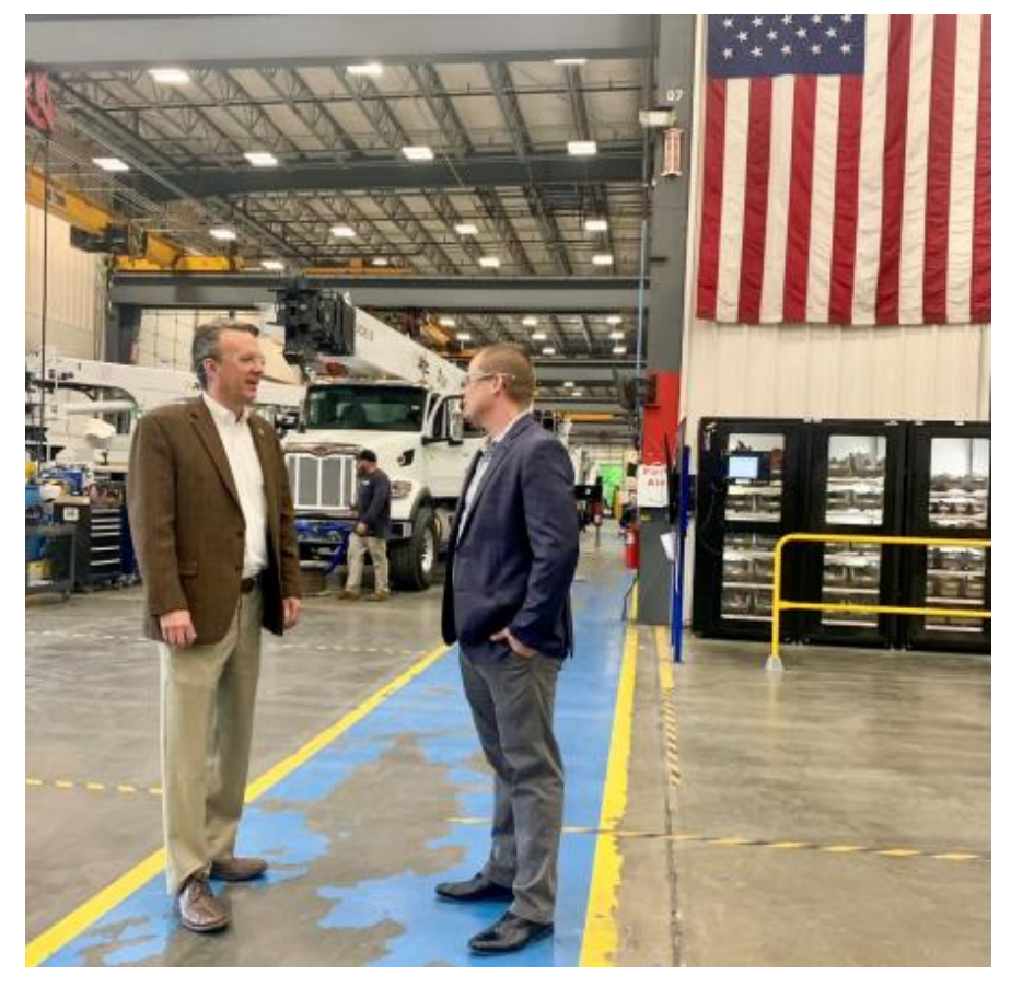
Altec Inc. - Daleville, VA