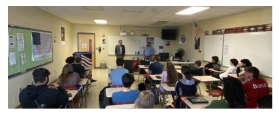
Jefferson Forest High School - Forest, VA