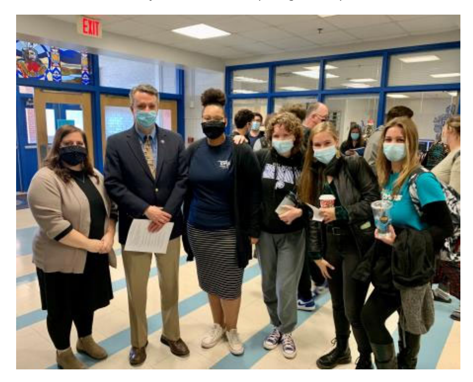
Fort Defiance High School (Fort Defiance)