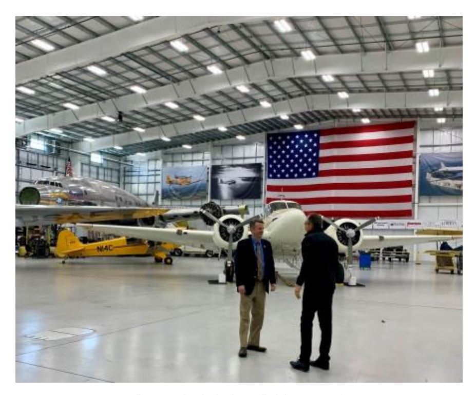
Dynamic Aviation (Bridgewater)