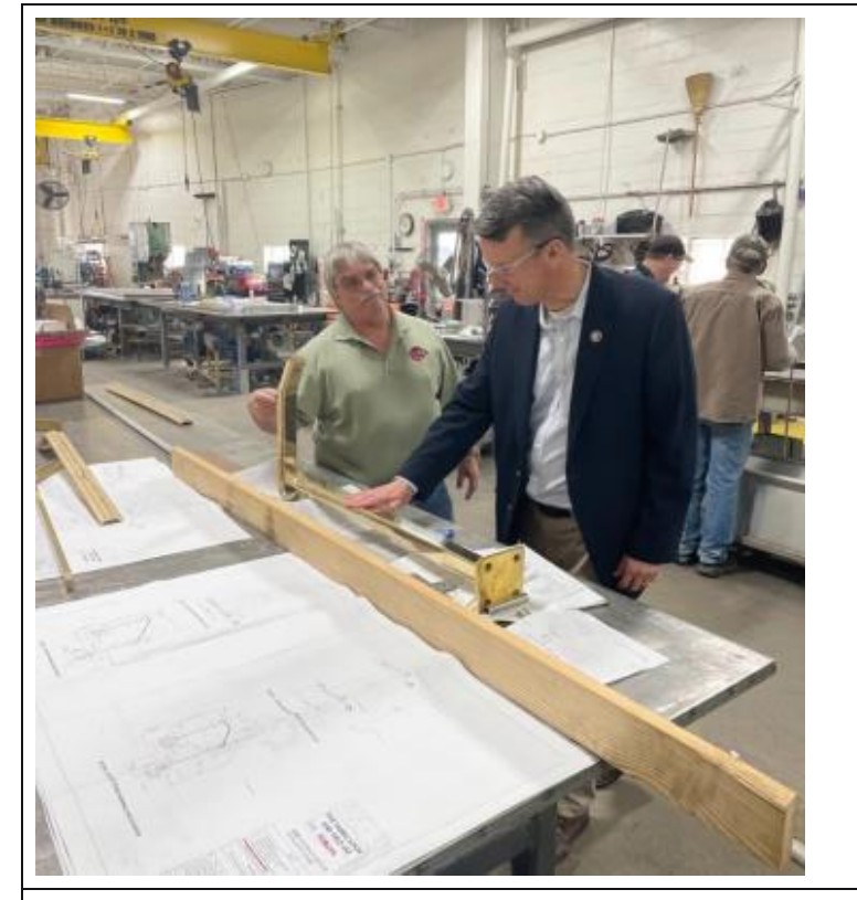
Touring Shickel Corporation's plant in Bridgewater