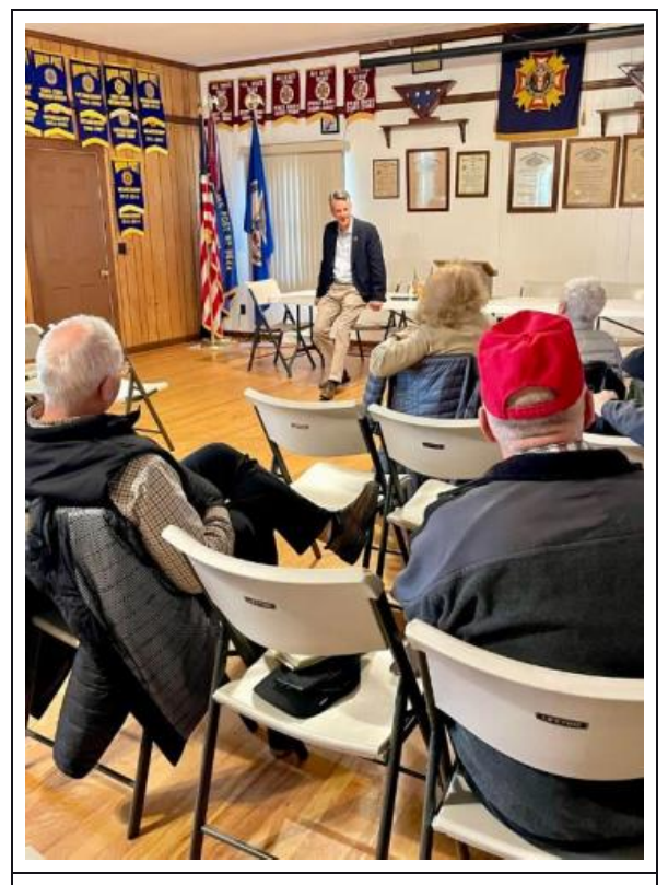
Rockingham County Town Hall