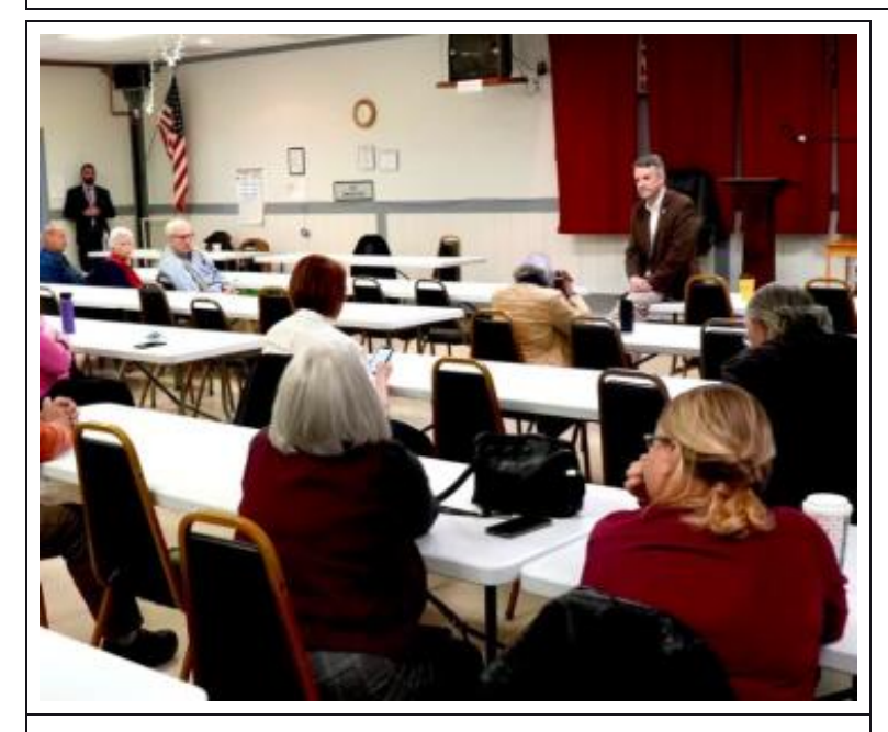
Waynesboro Town Hall