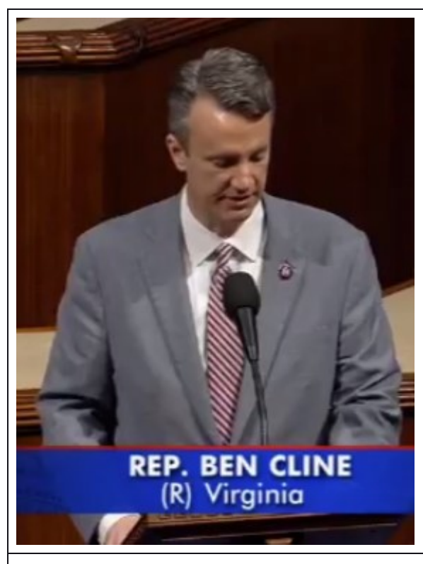
Click <u>here</u> to watch my floor speech pushing for an all-of-the-above energy strategy