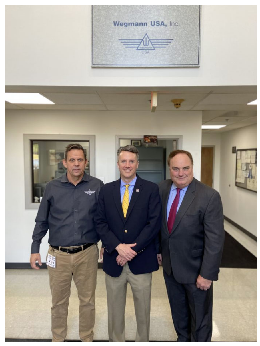
Wegmann USA, Inc. (Lynchburg)