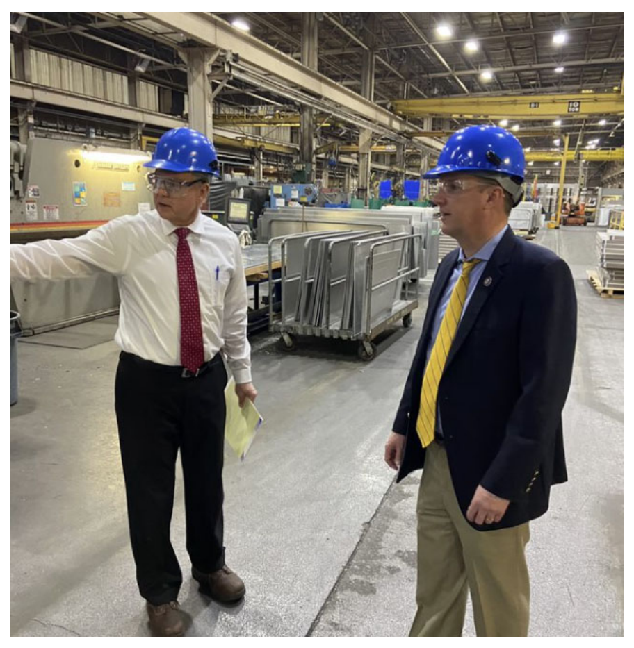
Buffalo Air Handling (Amherst)