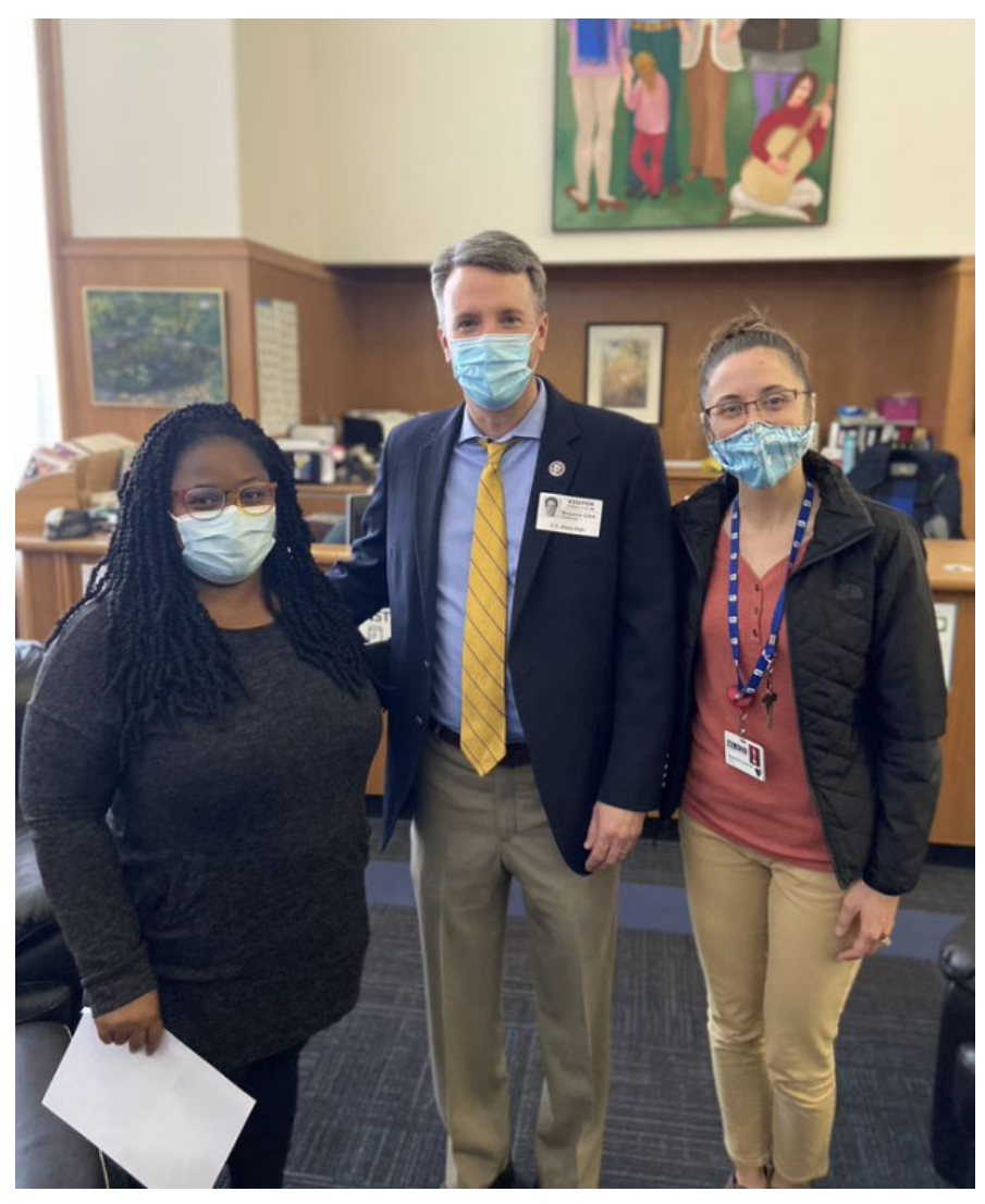
E.C. Glass High School (Lynchburg)