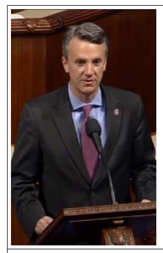
Click here to watch my speech celebrating 150 years for HPD