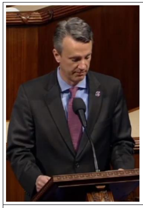
Click here to watch my House floor speech on rising costs during the holiday season