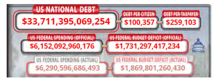
Honoring 248 Years of the United States Marine Corps

If we continue this unsustainable tax-and-spending spree, and the debt continues to skyrocket before our eyes, our country, our economy, and our families will continue to be harmed by the resulting record-high inflation and limits on access to capital. With the appropriations process underway, we are working to rein in out-of-control spending, restore economic freedom, and unleash prosperity in America once again.