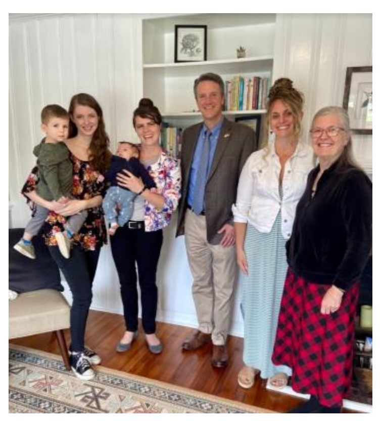
I enjoyed celebrating National Midwifery Week at Trillium House in Lynchburg.