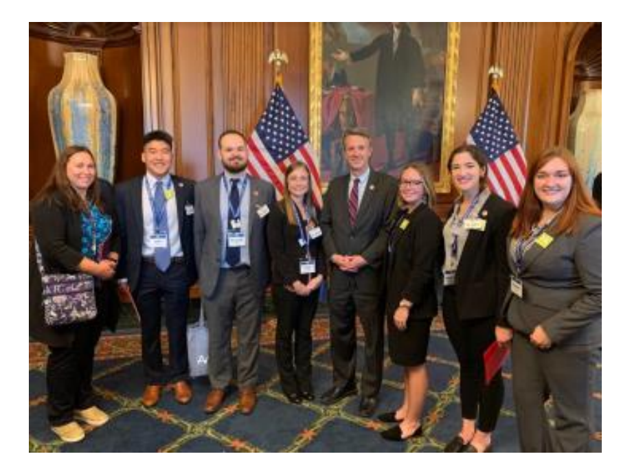
It was great meeting with constituents of the American Academy of Physician Associates and hearing of the important work they do.