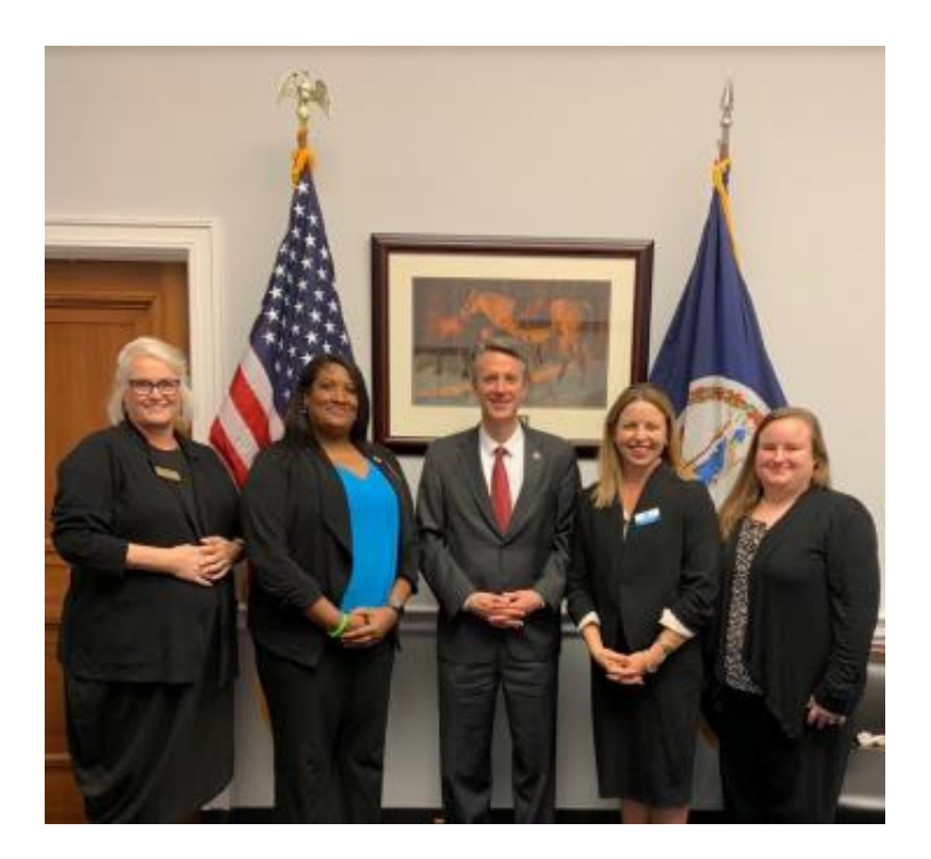
Boys & Girls Clubs of America offers millions of kids safe, fun, and innovative after-school programs. I was pleased to meet with representatives of VA-06 Boys & Girls Clubs last week in Washington.