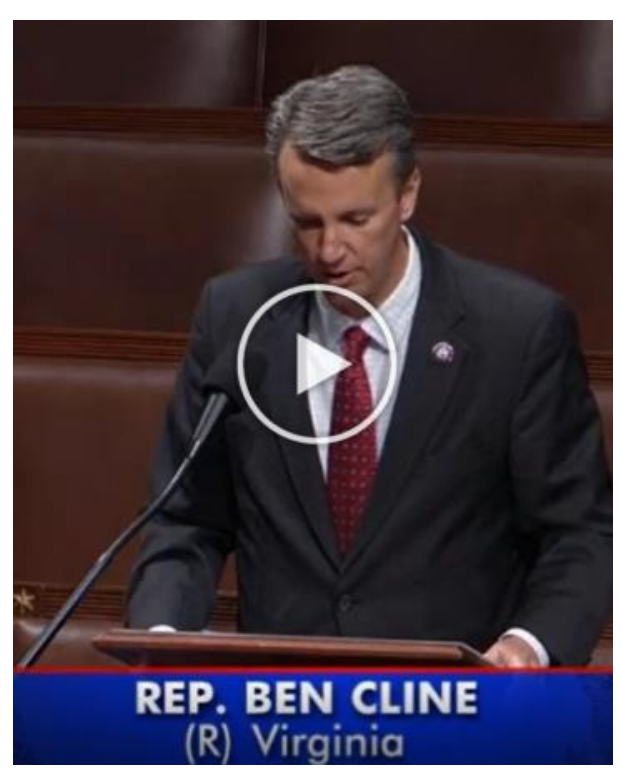
Speaking against the faulty continuing resolution on the House Floor

Americans are hurting and their paychecks are suffering, yet Democrats continue to fund damaging policies with billions of American taxpayer dollars. The American people and western Virginians deserve better. Soon they will have a chance to change course to a brighter future.