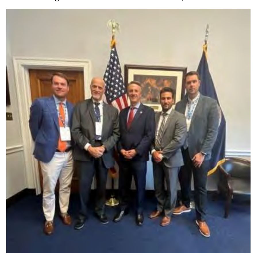
The National Automobile Dealers Association represents more than 16,000 new-car and truck

It was a pleasure meeting with representatives of the Old Dominion Association of Church Schools and learning more about their efforts to expand school choice.