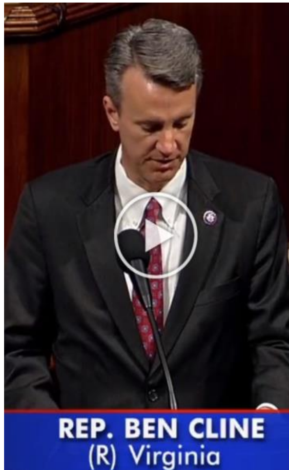
Addressing the border crisis on the House Floor