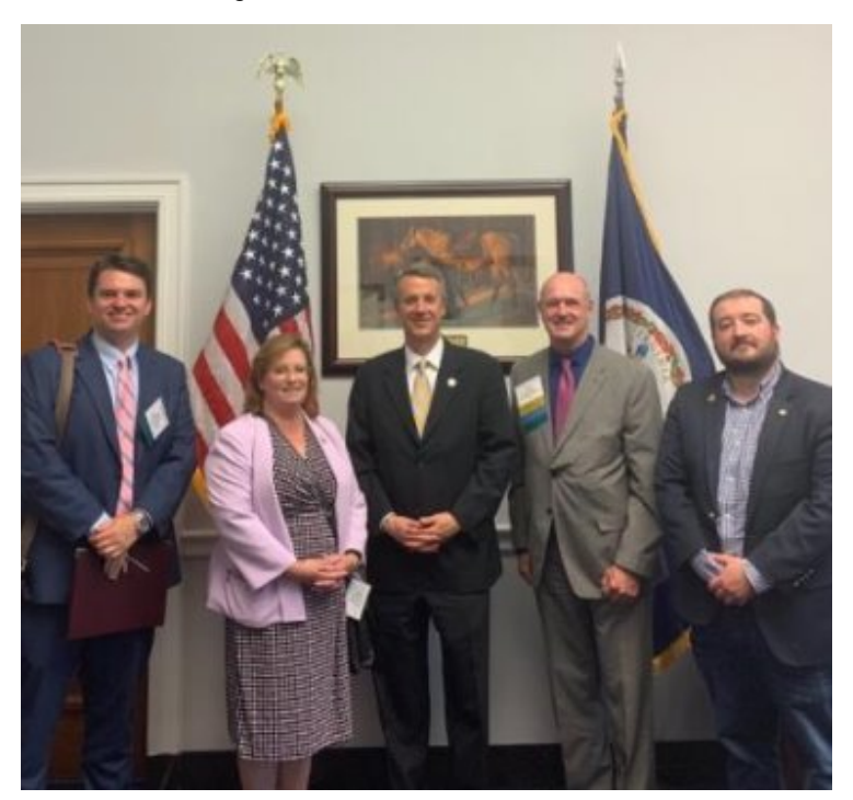
Meeting with the Manufactured Housing Institute