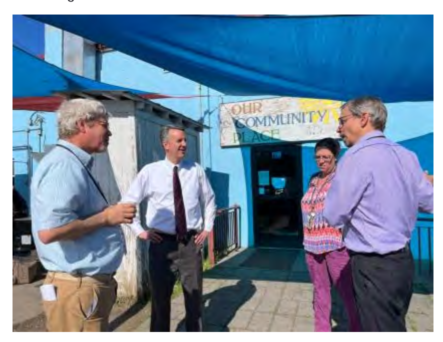
Roanoke Bar Association Annual Law Day

I enjoyed touring Our Community Place in Harrisonburg and learning more about their important work to care for those in need by fostering positive relationships, offering affordable housing, and instilling the value of hard work.