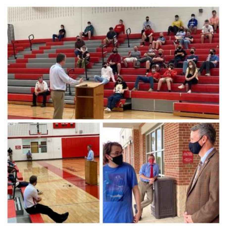
Stonewall Jackson High School

Since taking office, it has been a priority of mine to meet with students across the Sixth District. As they prepare for the next steps in their lives, whether that be continuing their education, entering the workforce, or joining the military I wish to instill in them the importance of service to others. This week, I visited Stonewall Jackson High School in Quicksburg and enjoyed answering students' questions about the issues that are important to them. I also spoke virtually with students at Valley Elementary School and Millboro Elementary School in Bath County to discuss how the legislative process works. As more schools begin to reopen for in-person learning, I look forward to meeting with students and fostering the value of public service.