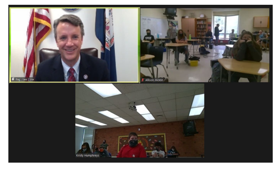
Valley Elementary School and Millboro Elementary School