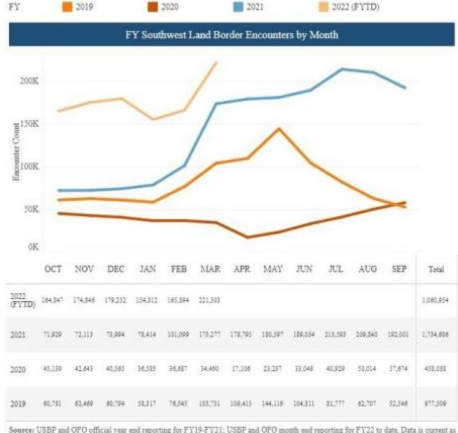
Source: USBP and OFO official year end reporting for FY19-FY21; USBP and OFO month end reporting for FY22 to date. Data is current as of 04/05/2022.