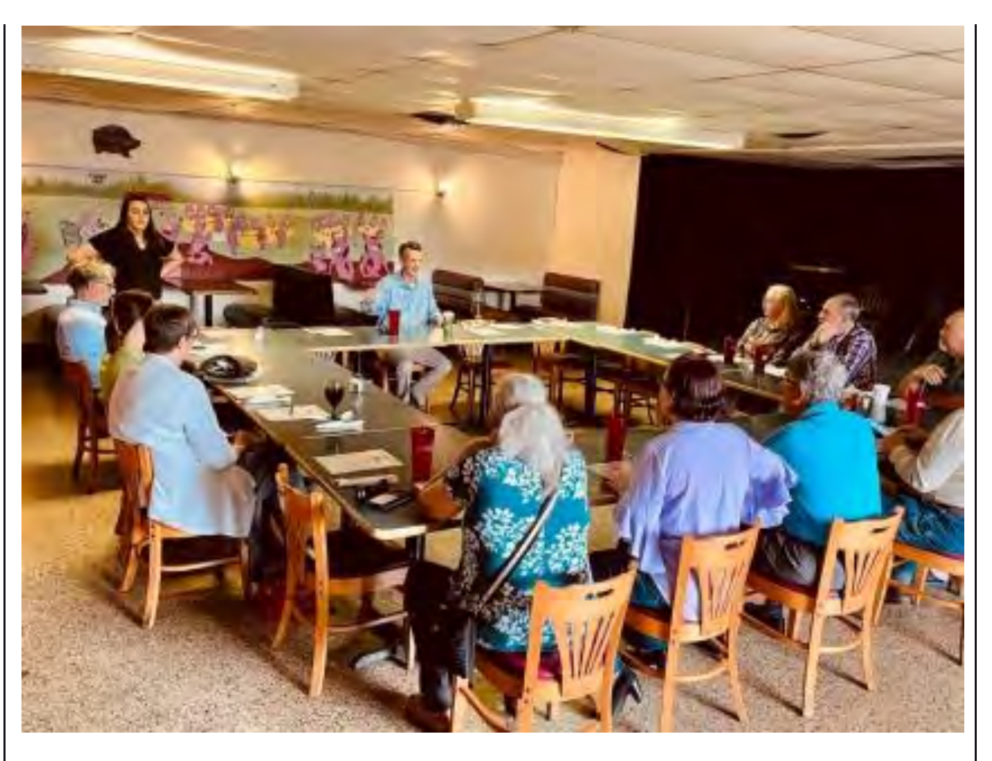
The Historic 29th Infantry Division

This week I had the pleasure and honor of touring the 29th Division Museum in Verona. The historic 29th Infantry Division saw service in WWI and WWII, the Global War on Terrorism, Iraq, and Afghanistan. It includes 5 Medal of Honor recipients and the Bedford Boys, who stormed the beaches of Normandy on D-Day to begin the Allied resistance against the Nazi occupation of France. I highly recommend you check out the museum that honors the centuries of service of this historic division of troops.