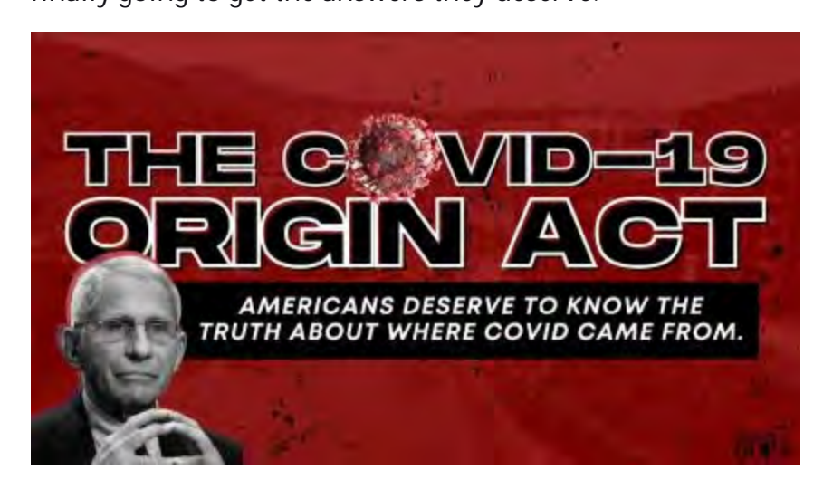
Attacking Government Censorship, Restoring Freedom

With each passing day, the real role that China and a complicit media played in spreading falsehoods as to the origin and spread of COVID becomes clearer. In an effort to expose the truth, Congress unanimously passed, 419-0, the COVID-19 Origin Act (H.R. 1376), which requires the Biden Administration to declassify all information relating to potential links between the Wuhan Institute of Virology and the origin of COVID-19. Passing this legislation ensures that Americans are finally going to get the answers they deserve.