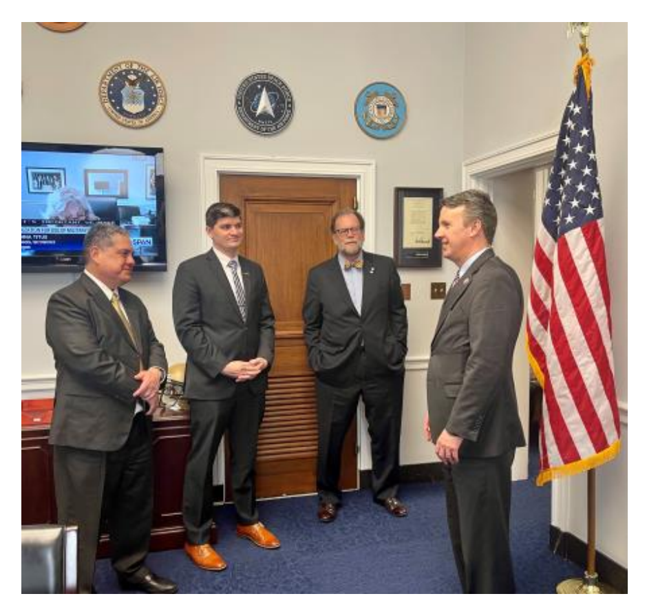
Rep. Cline meets with Veteran representatives from Iraq and Afghanistan Veterans of America and the Independence Fund