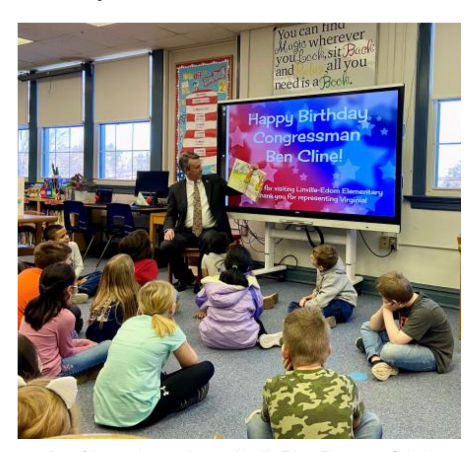
Rep. Cline reads to students at Linville-Edom Elementary School

As the Representative for Virginia's Sixth District, one of my top priorities is making myself available to meet with constituents whether I'm here in the Commonwealth or in Washington. This week, I was pleased to read with students in Linville and hear from various advocacy groups from across our region.