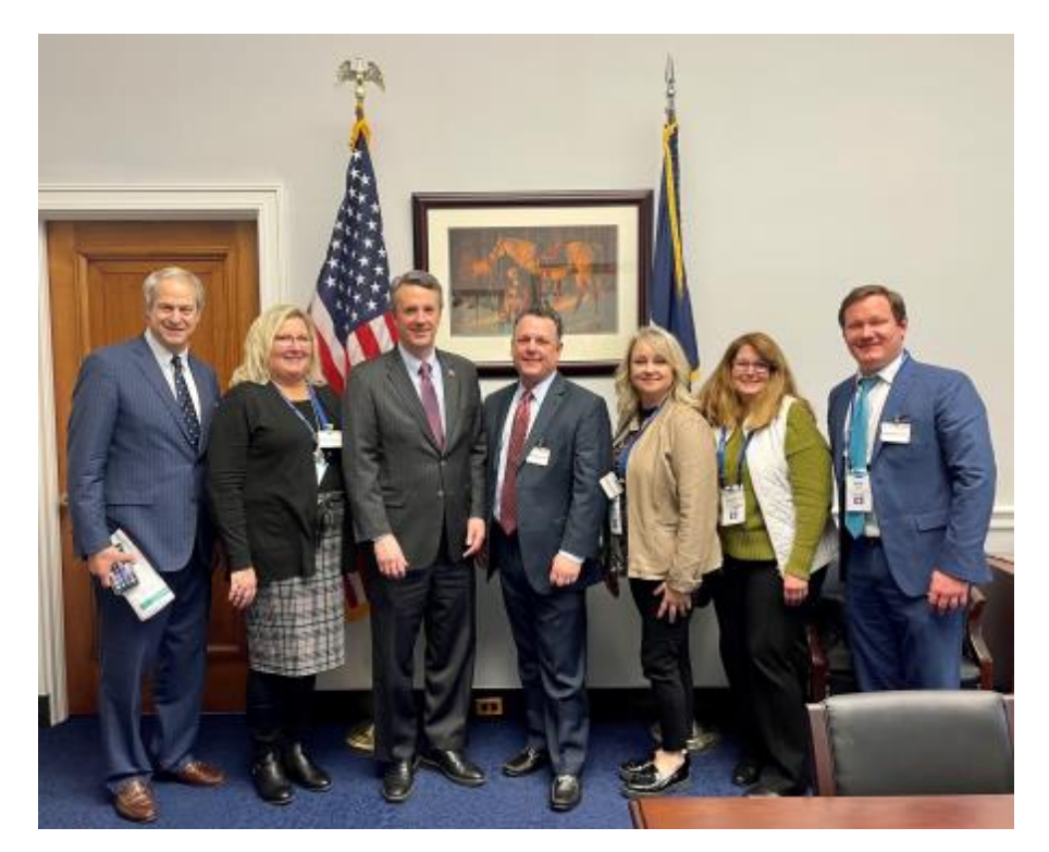
Rep. Cline meets with local broadcasters on behalf of the Virginia Association of Broadcasters