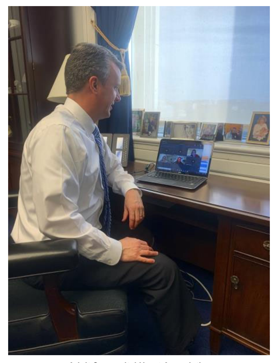
Adult Congenital Heart Association