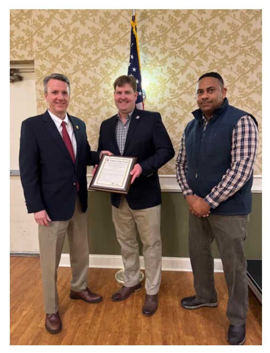
For 90 years, the Salem Rescue Squad has displayed selfless sacrifice to the city of Salem as it stands as the second oldest all-volunteer rescue squad in the United States. It was an honor to present them with a commemorative plaque recognizing the squad winning the 2023 Volunteer EMS Service of the Year award at their banquet.