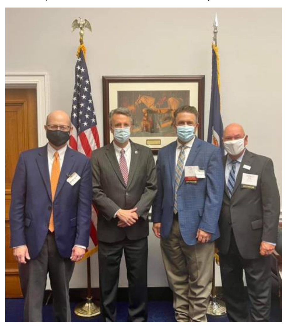
Rep. Cline meets with members of the Virginia poultry industry at his office in Washington.