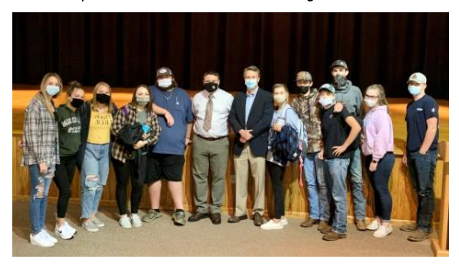
Rep. Cline meets with students at Bath County High School in Hot Springs.