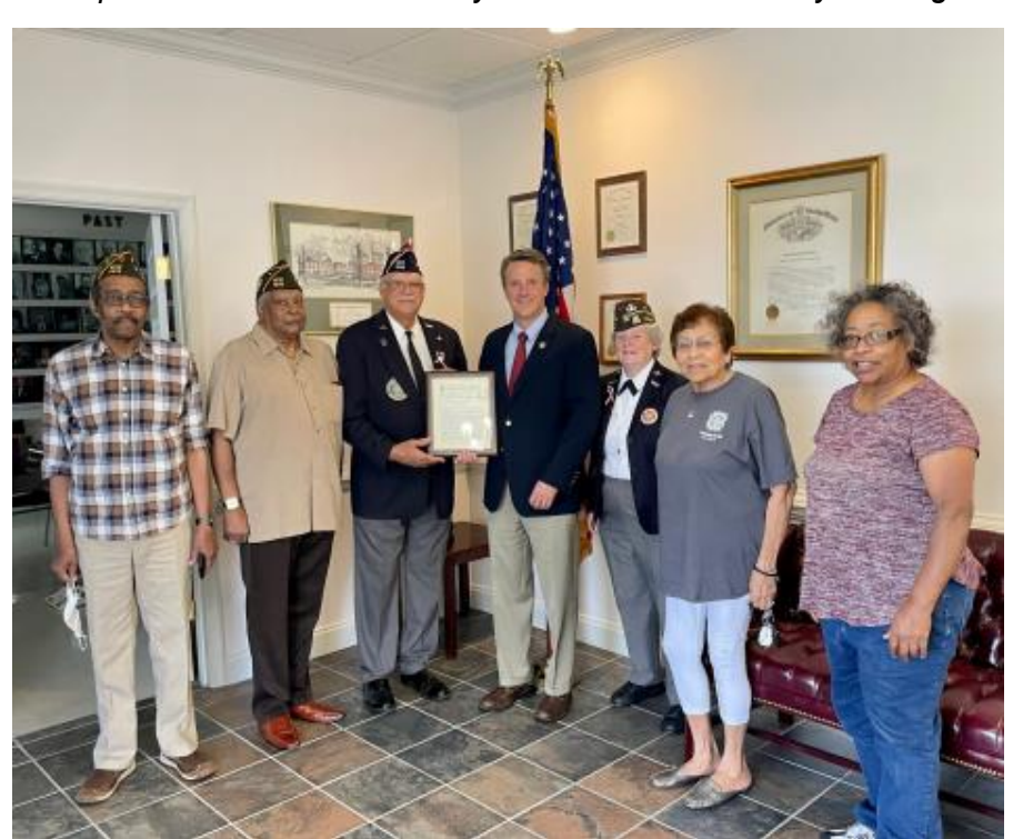
Rep. Cline celebrates the 75th anniversary of the Thomas-Fields VFW Post in Staunton.