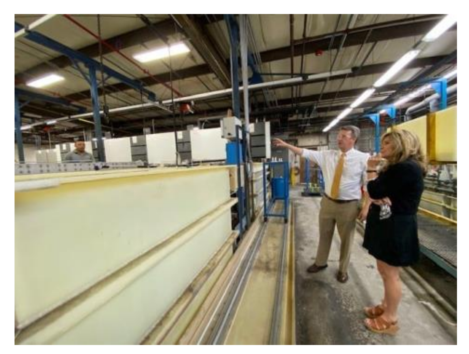
Rep. Cline tours Global Metal Finishing in Roanoke.