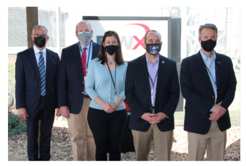
Rep. Cline and other members of the Virginia Congressional delegation tour BWXT in Lynchburg.