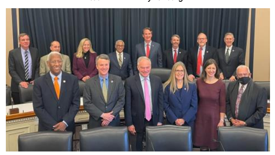
Rep. Cline and the rest of the Virginia Congressional Delegation meet with Governor-Elect Youngkin on Capitol Hill.