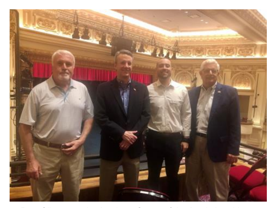
Rep. Cline tours the Academy Center of the Arts in Lynchburg.