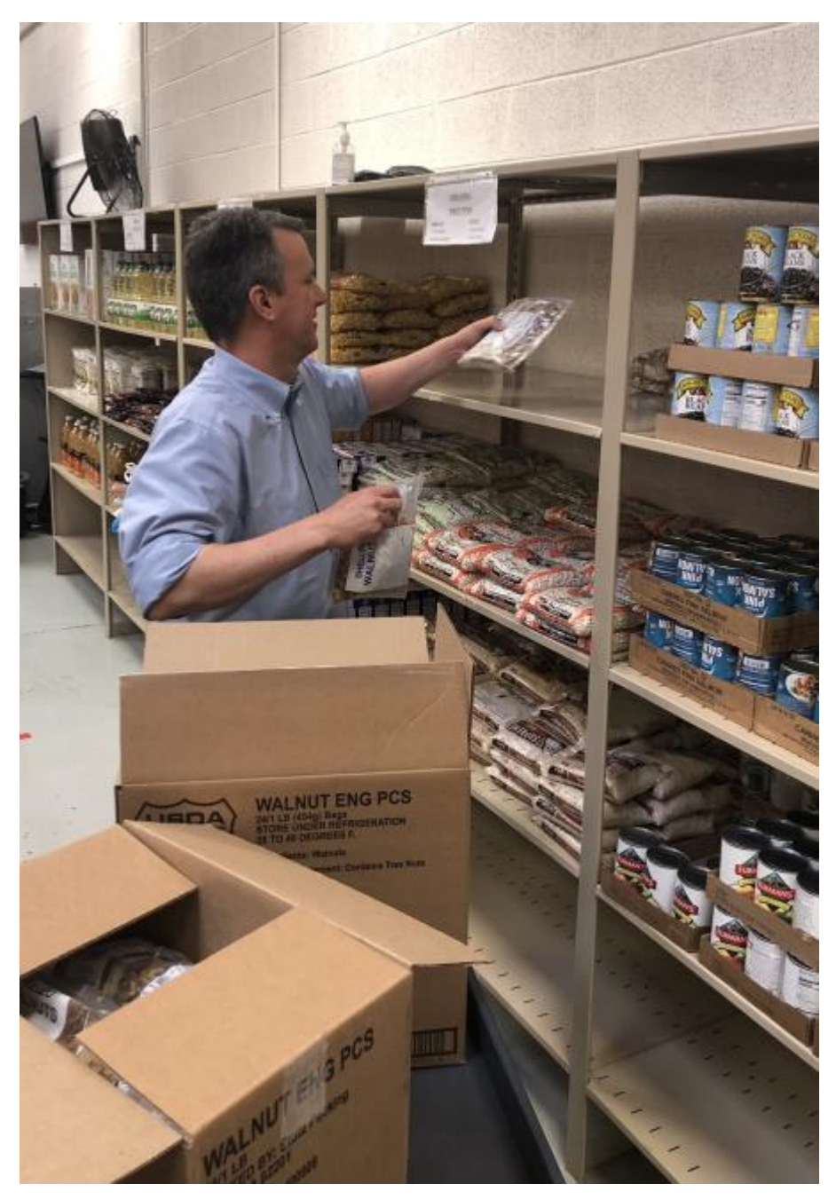
Rep. Cline volunteers at Neighbors Helping Neighbors of Amherst County.