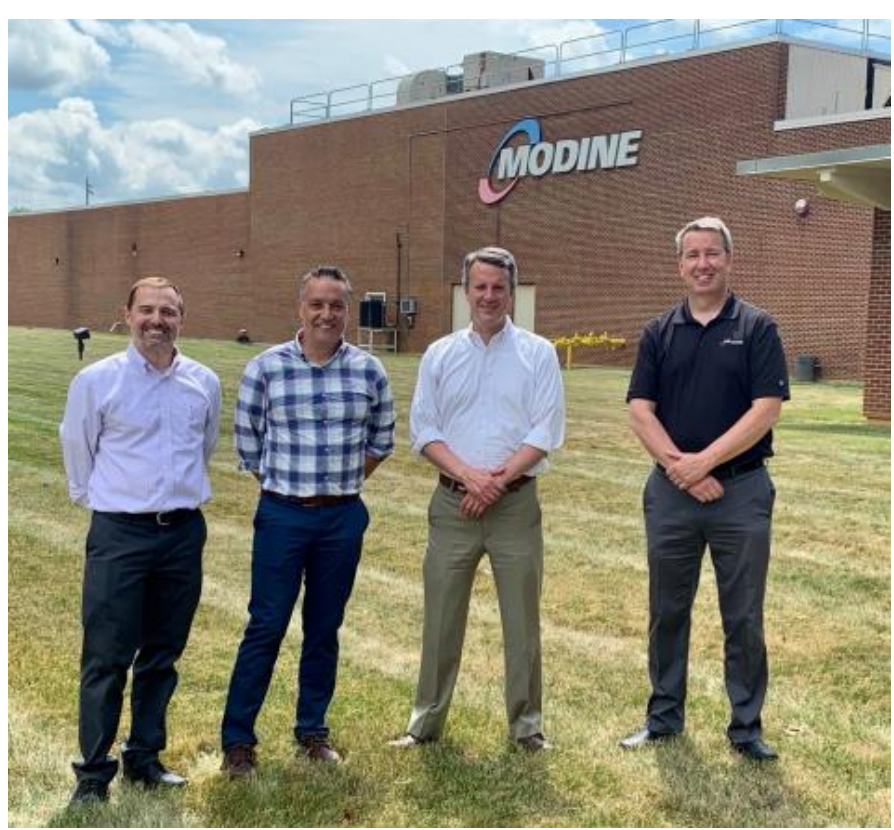
Rep. Cline visits Modine Manufacturing in Rockbridge County.