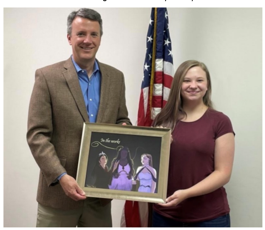
Rep. Cline recognizes the winner of the Sixth District's Congressional Art Competition.