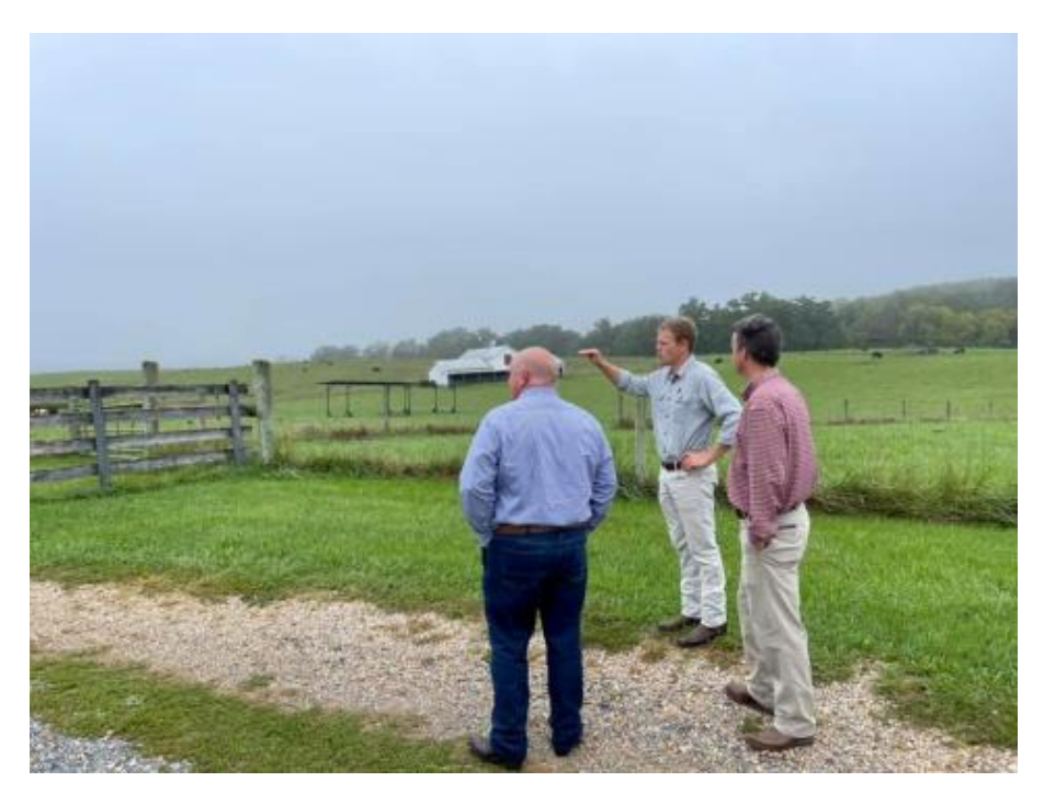
Rep. Cline is joined by the Ranking Member of the House Agriculture Committee on a Farm Tour of the Sixth District.