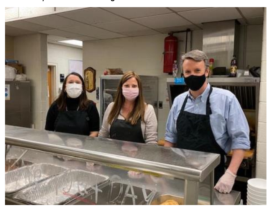
Rep. Cline volunteers at the Rescue Mission in Roanoke.