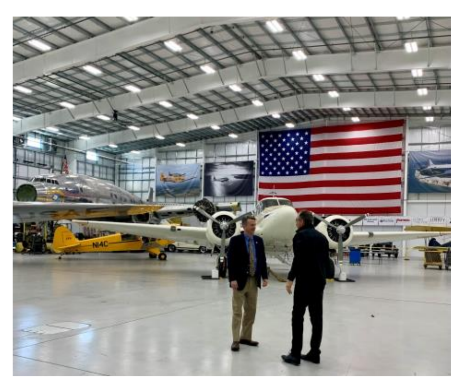
Rep. Cline tours Dynamic Aviation in Bridgewater.