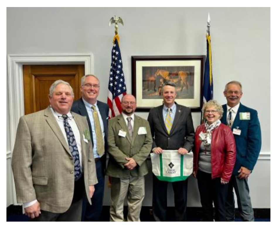
Rep. Cline meets with representatives from the Farm Credit of the Virginias at his office in Washington.