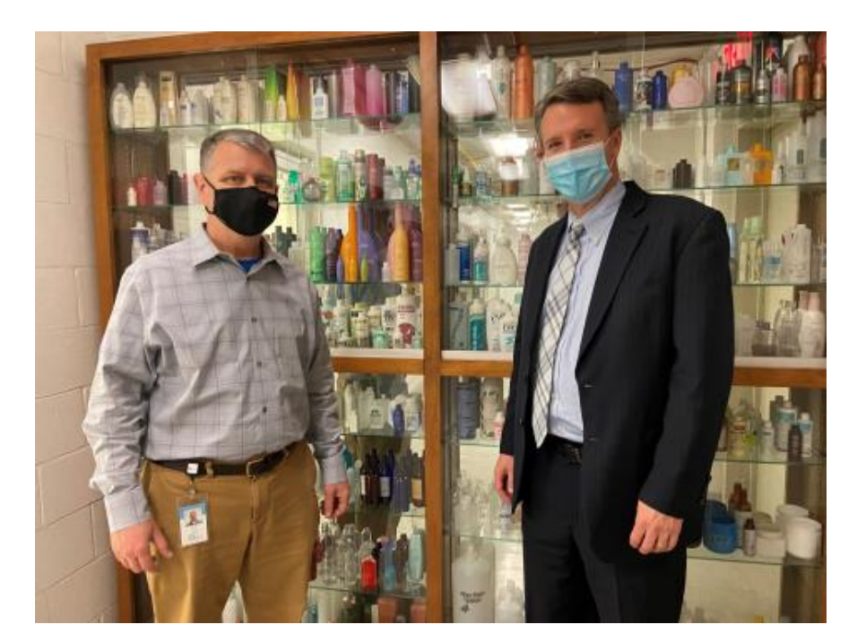
Rep. Cline tours Artisan Packaging in Harrisonburg.