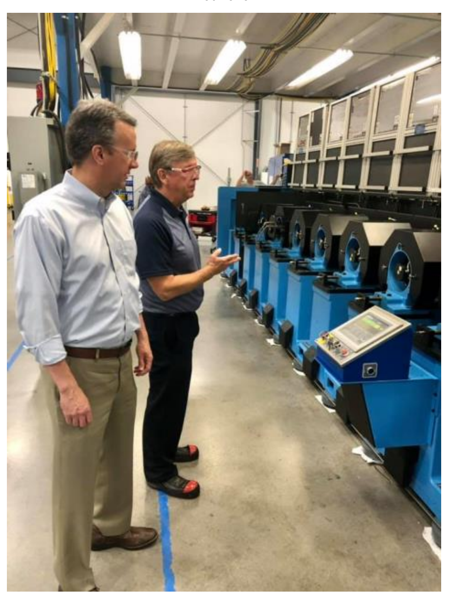
Rep. Cline tours Belvac's manufacturing facility in Lynchburg.