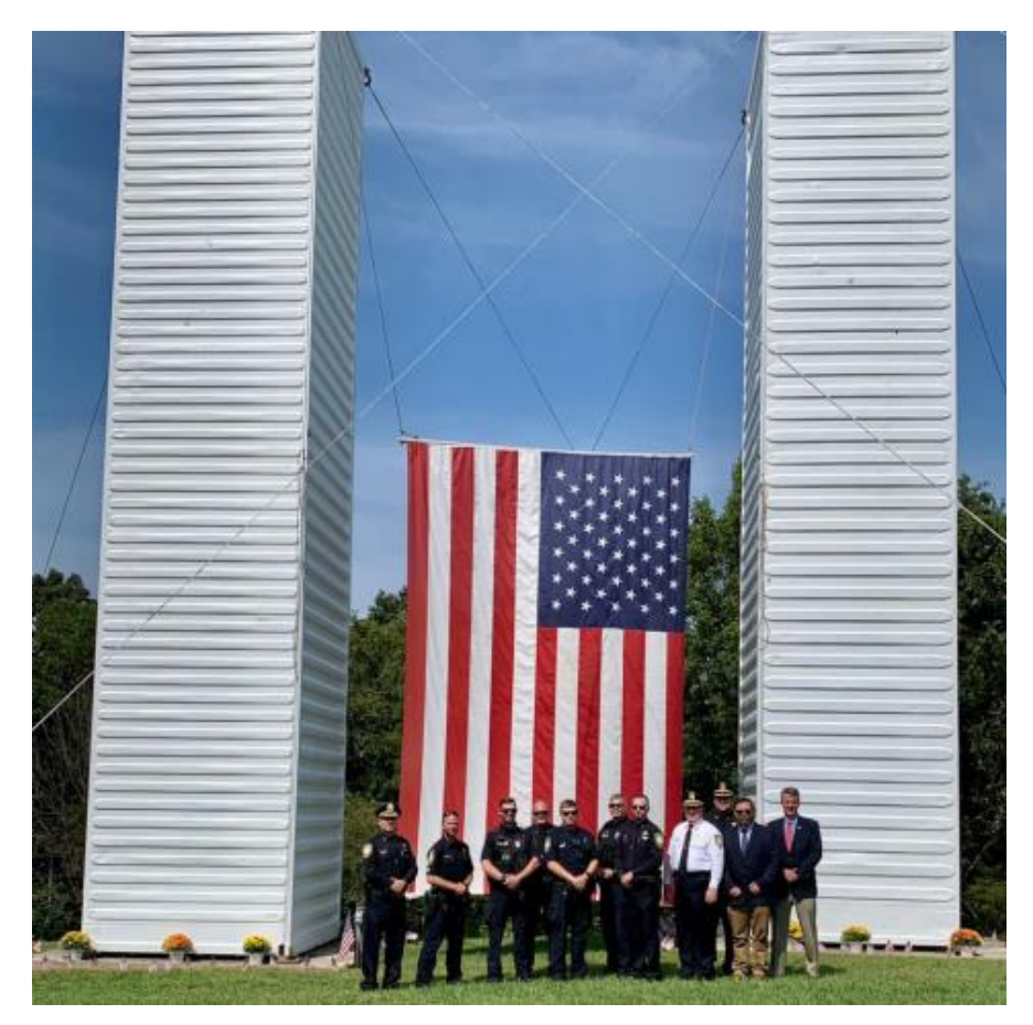
Rep. Cline joins first responders at the 9/11 tribute in Buena Vista.