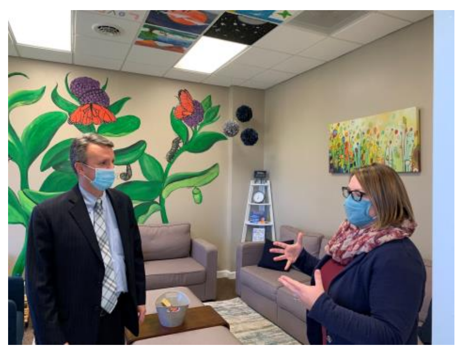
Rep. Cline visits the Valley Children's Advocacy Center in Staunton.