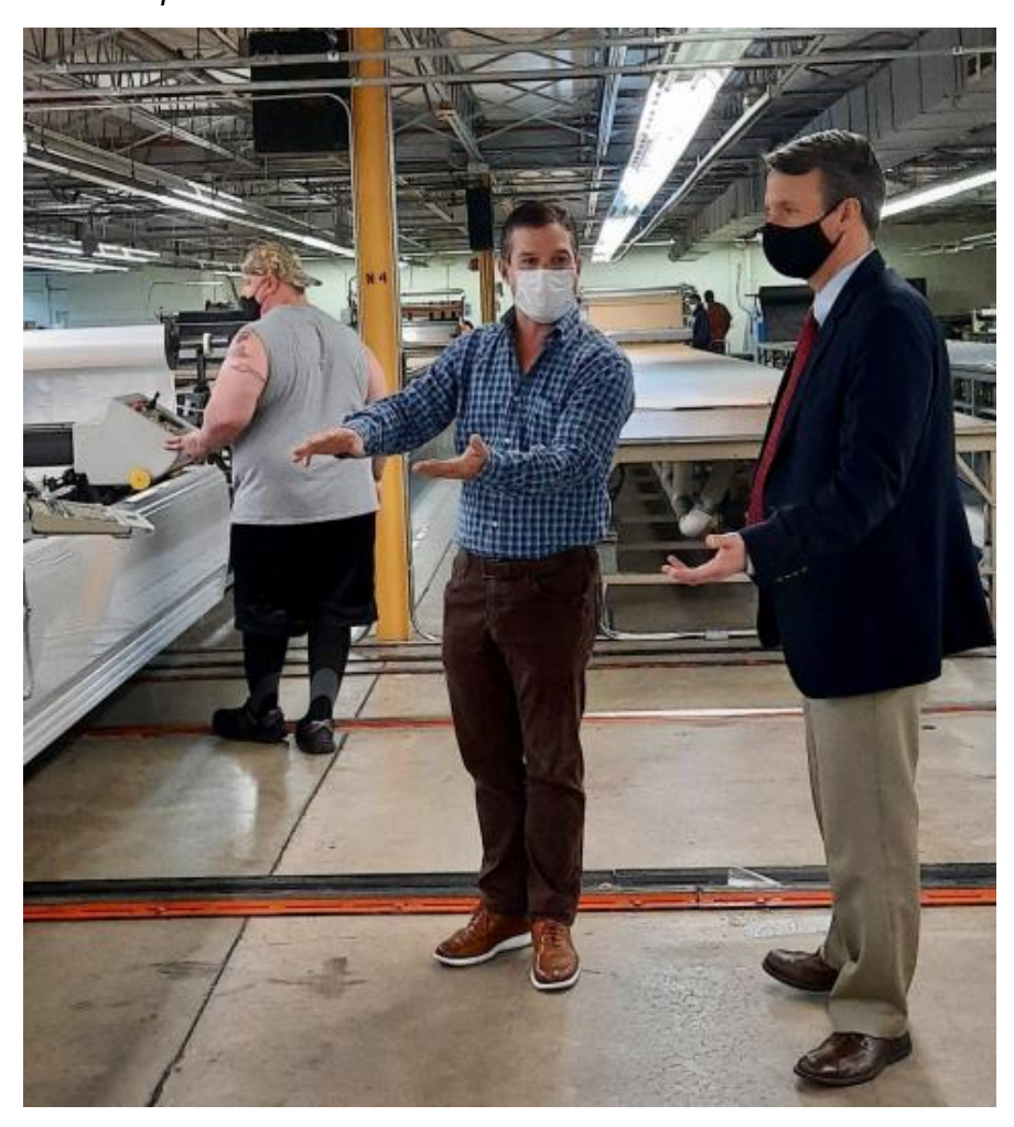
Rep. Cline tours Integrated Textile Solutions in Vinton.