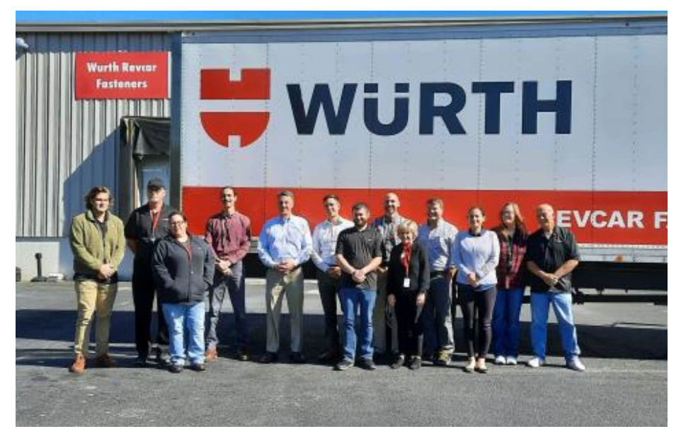
Rep. Cline visits Wurth Industries in Roanoke.