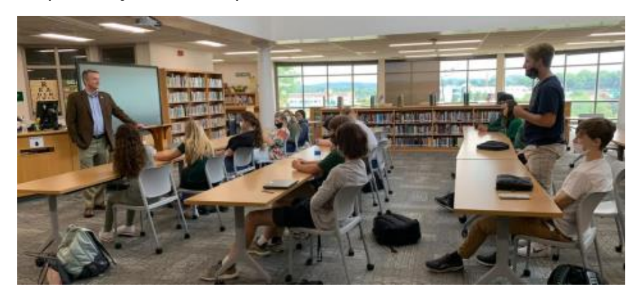
Rep. Cline speaks with students at Roanoke Catholic.