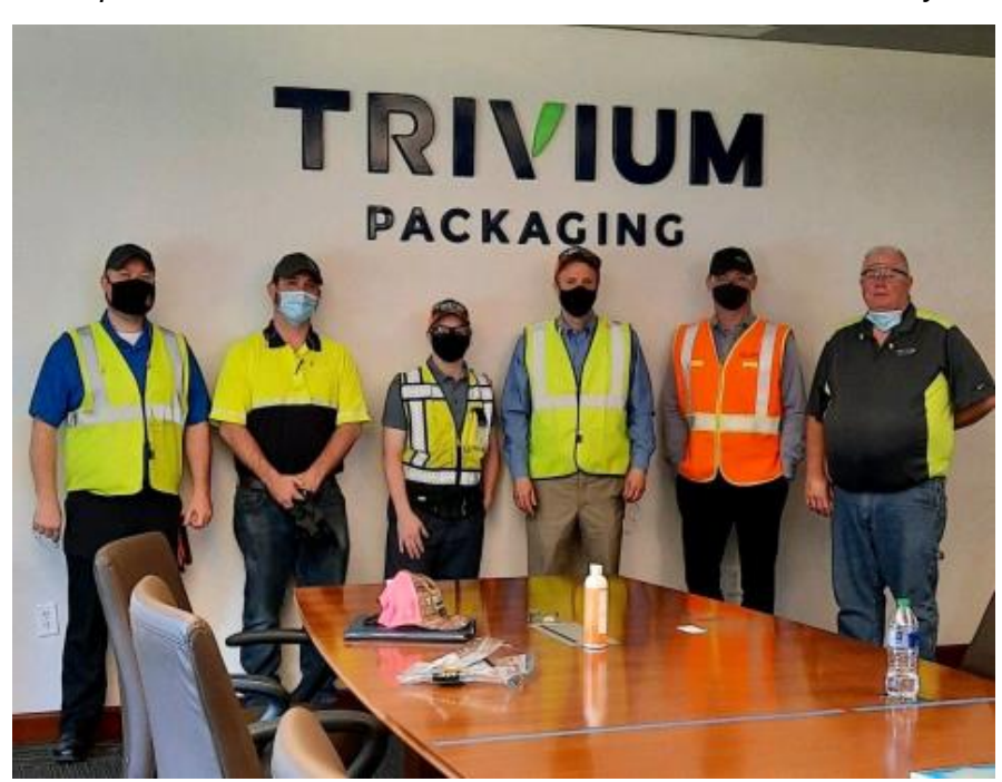
Rep. Cline visits Trivium Packaging in Roanoke.