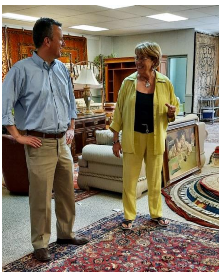
Rep. Cline visits Crowning Touch in Roanoke.