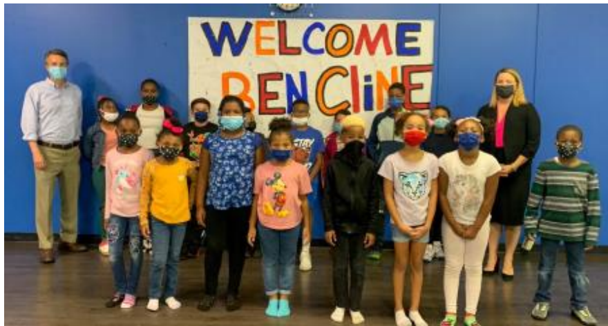
Boys & Girls Clubs of SWVA (Roanoke)

I always enjoy the opportunity to travel throughout our region meeting with constituents and businesses. Recently, I met with the Boys & Girls Clubs of SWVA in Roanoke, as well as toured manufacturing facilities in Weyers Cave and Lynchburg.