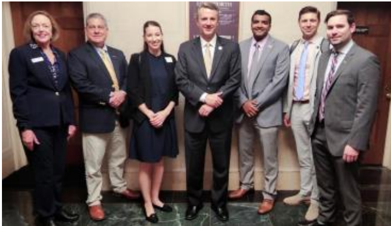
Meeting with a number of Veterans Service Organizations to discuss the PACT Act, including the Military Officers Association of America, the American Legion, the Tragedy Assistance Program For Survivors, Veterans of Foreign Wars, and Iraq and Afghanistan Veterans of America

Supporting our troops with the needs to fight our Nation's battles when called upon and fighting for those who fought for us continues to be one of my top priorities as your Representative.