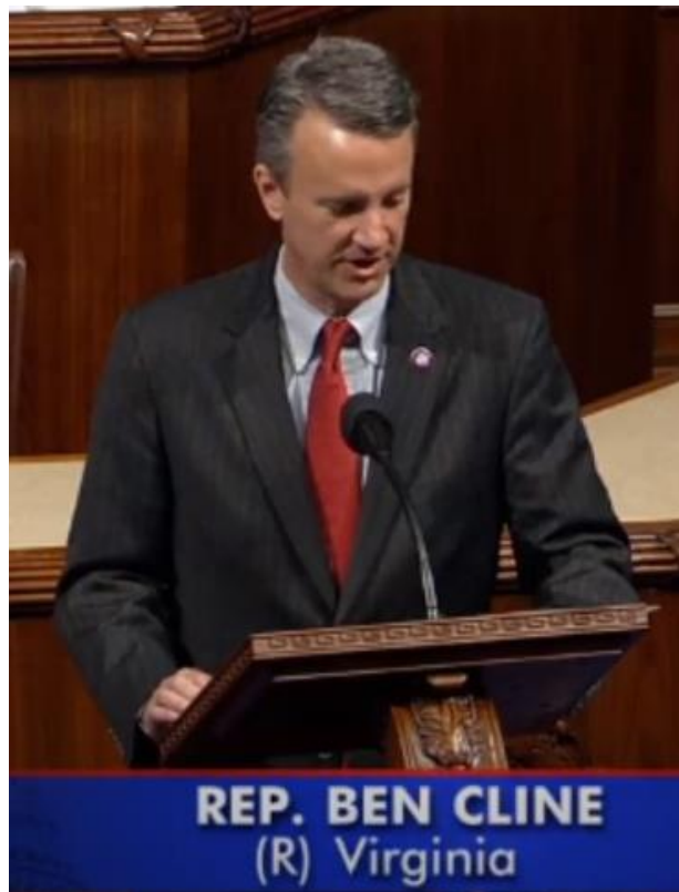
Honoring Big Brothers Big Sisters of Harrisonburg-Rockingham County