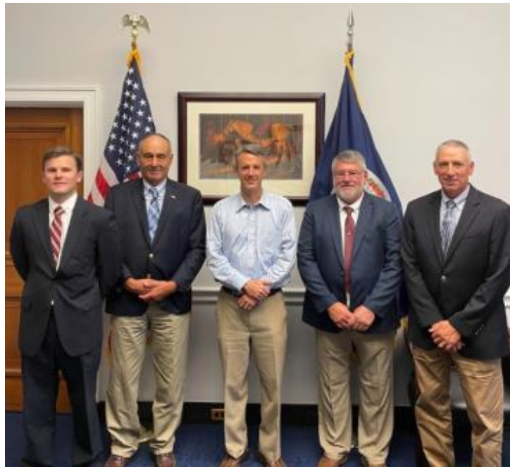
Meeting with members of the Virginia Farm Bureau