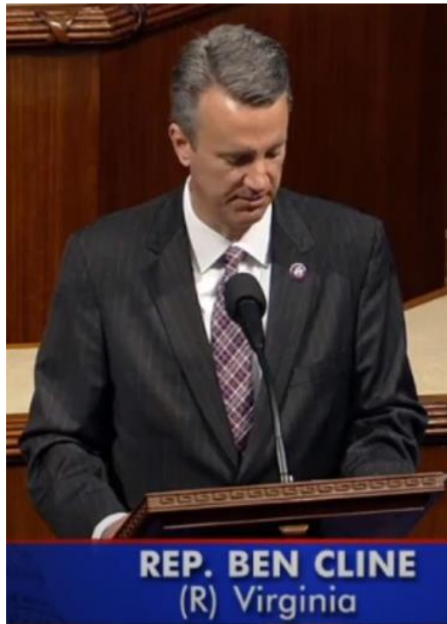
Discussing inflation and the need to stop massive deficit spending on the House Floor

wake-up call to return to fiscal sanity for Democrats in Congress and President Biden. Unfortunately, no one needs a crystal ball to predict that my colleagues on the other side of the aisle will hit the snooze button on this wake-up call. However, I will continue to fight to rein in spending to drive down inflation, unleash the American economy, and protect the wallets of the American people.