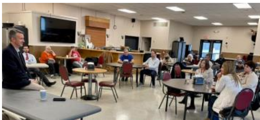
Shenandoah County Town Hall