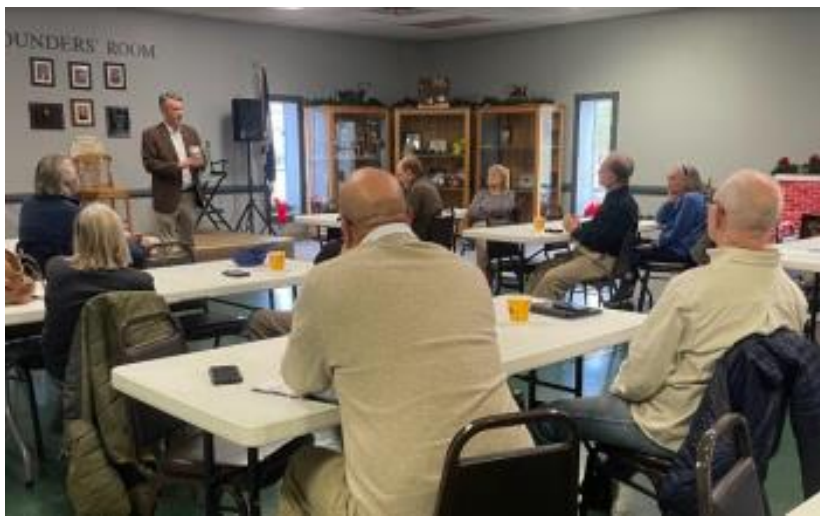
Rockbridge County Town Hall