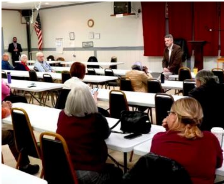
Waynesboro Town Hall