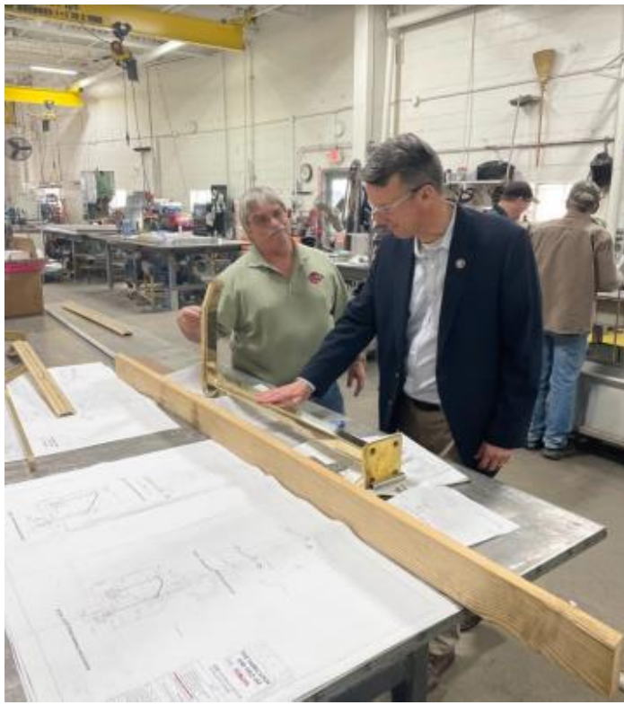
Touring Shickel Corporation's plant in Bridgewater