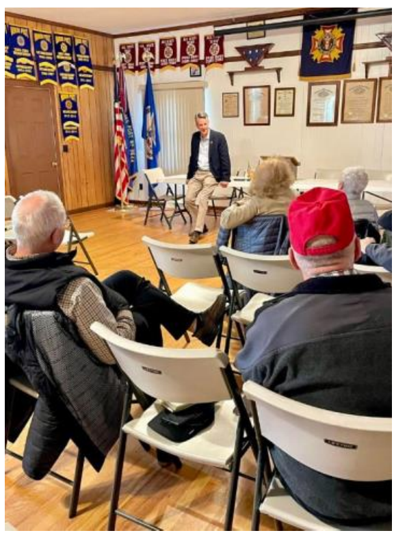
Rockingham County Town Hall