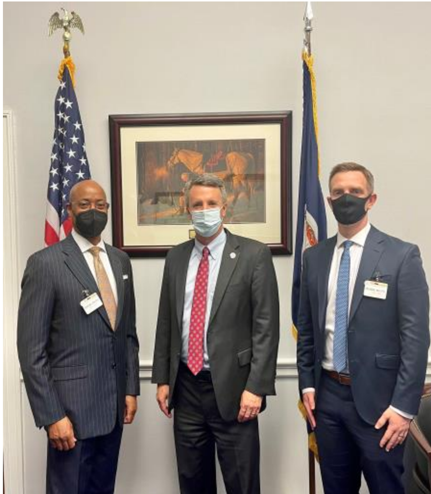
Virginia Commercial Space Flight Authority

As the Representative for the Sixth District, I remain committed to meeting with constituents and advocacy groups both at home and in Washington. This week, I enjoyed hearing from constituents in-person and virtually to learn more about the issues that matter most to them.