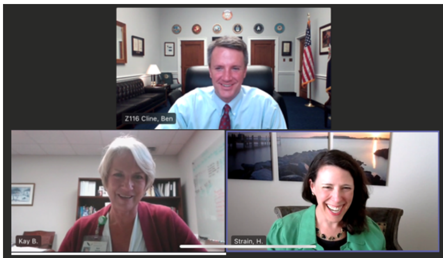
Centra Specialty Hospital