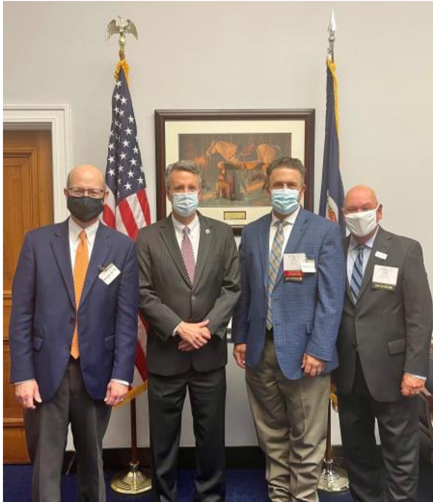
Virginia Poultry Federation