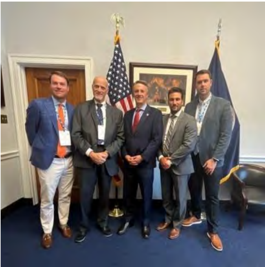
The National Automobile Dealers Association represents more than 16,000 new-car and truck