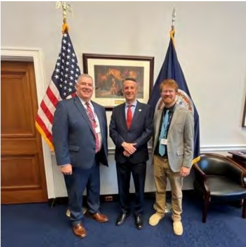
It was a pleasure meeting with representatives of the Old Dominion Association of Church Schools and learning more about their efforts to expand school choice.