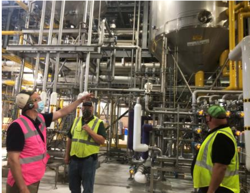
Molson Coors Beverage Company (Elkton)

As the representative for the Sixth District, I continue to make myself available to those I serve. During this August District Work Period, I have enjoyed the opportunity to meet with individual constituents in my office, tour countless small businesses and manufacturing facilities, and participate in community events.