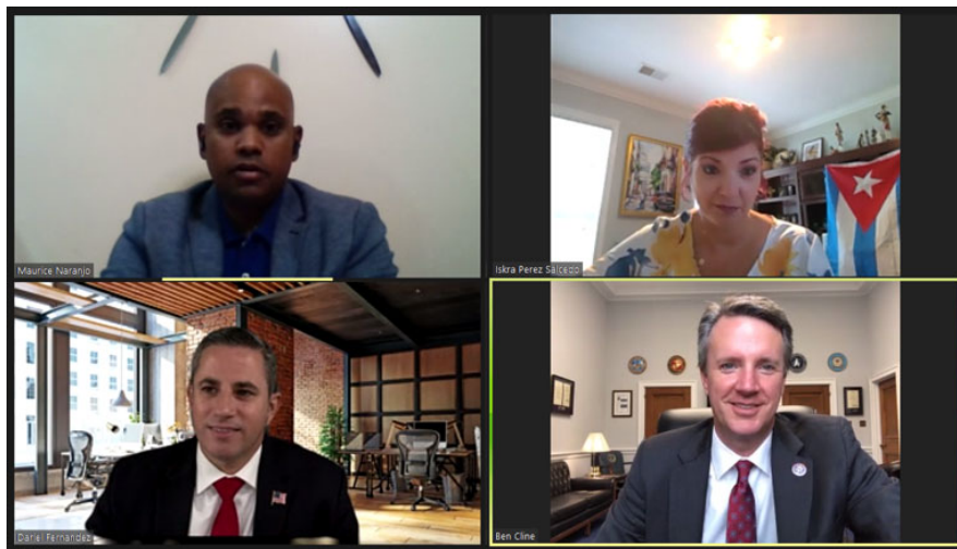
Advocating for a Free Cuba

Thank you for the opportunity to serve as your Congressman. If my office can ever be of assistance, please contact my Washington office at (202) 225-5431.