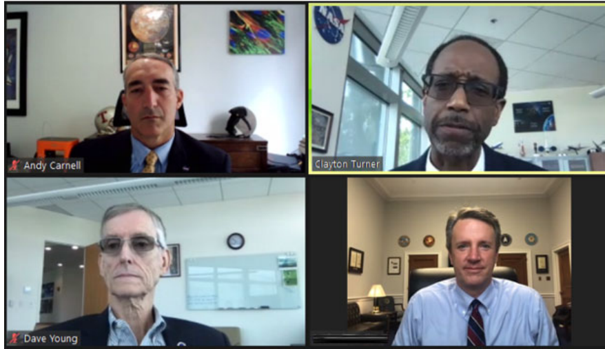
NASA Langley Research Center