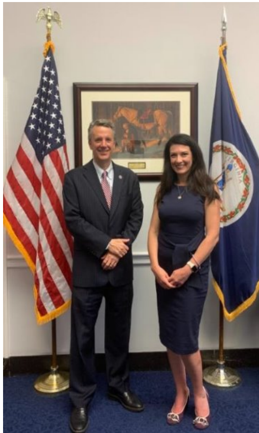
Meeting with the American Nurses Association