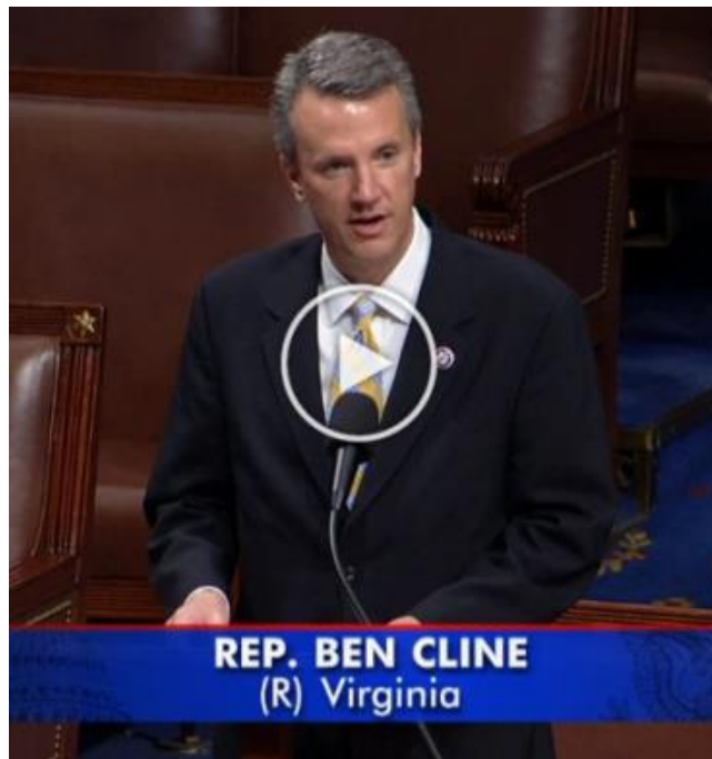
Speaking against gun control on the House Floor