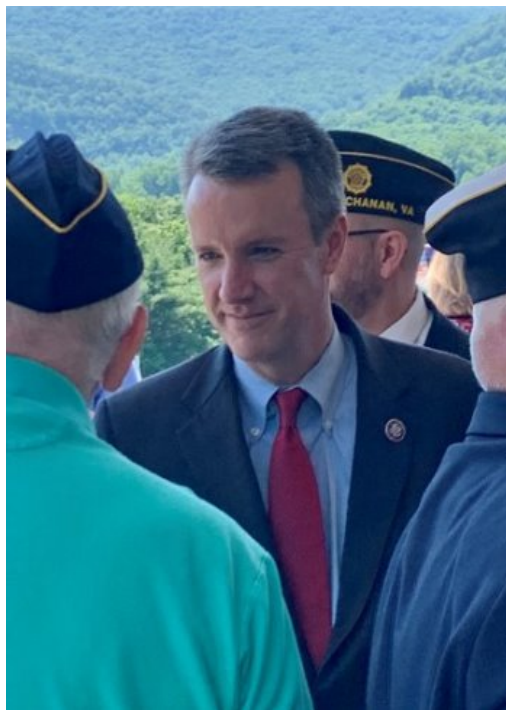
Meeting with Veterans from across the District

This week, as part of the Promise to Address Comprehensive Toxics (PACT) Act dealing with toxic exposures of burn pits, I joined with Congressman Chris Pappas in introducing the VA Workforce Investment Act . The legislation is a bipartisan effort to bolster VA's workforce and strengthen VA facilities' ability to better recruit and retain high-quality, highly skilled staff needed to properly serve Veterans seeking VA healthcare services. Making sure our Veterans have timely access to quality care is essential to meeting their unique healthcare needs. Ensuring areas like ours can recruit, train, and retain healthcare professionals in rural VA facilities is key to meeting this goal. I was pleased to work in a bipartisan effort with Congressman Pappas to provide incentives and utilize best practices to improve and expand medical staff within the VA Medical Systems, especially in rural areas like ours.