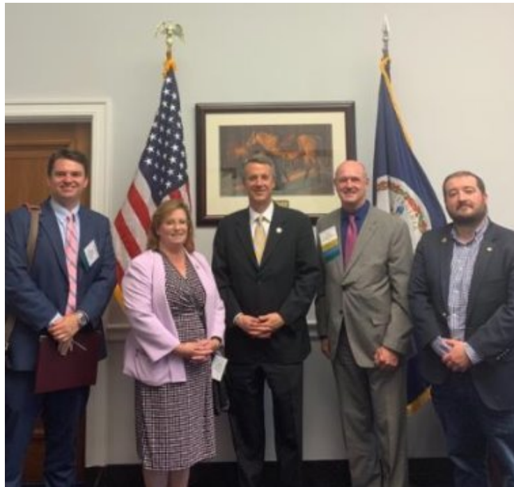
Meeting with the Manufactured Housing Institute