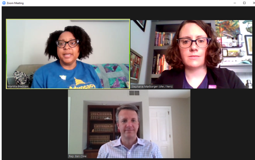
American Foundation for Suicide Prevention